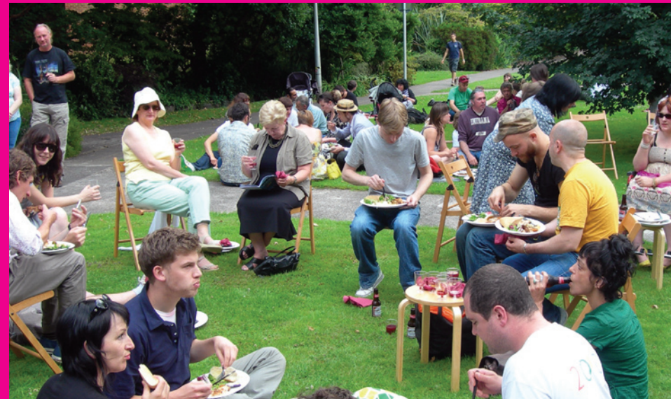
John Hansard Gallery Summer Party 2008