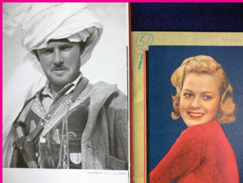
Mass Observation Archive

In conjunction with English Anxieties and the theme of Mass Observation , participants can drop-in and create their own Mass Observation Archive . We will make an archive book / album to record our findings of mass observation in the 21st century. Participants are required to bring in their own examples of Mass Observation for the workshop – such as....?