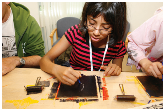
Bronze Arts Award Taster Day participant, May 2009.

Over three Saturdays in May young people aged 11-18 participated in the John Hansard Gallery / Artsworld Bronze Art Award taster days. Throughout the programme, participants experienced different art forms such as mono printing and drama, researched their arts hero or heroine and reviewed the Desiring Necessities exhibition. As a result of the success of this programme, many of the participants will go on to complete this Level 1 nationally recognised qualification.