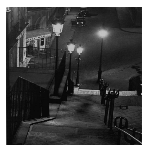
Figure 5a . Kertész The Daisy Bar, Montmartre, 1930