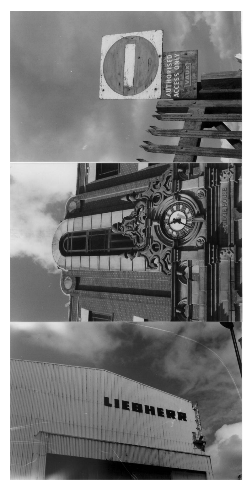
Plate 10 Author field photographs taken in and around Sunderland City Centre From Top to Bottom: Old Vaux Brewery sign, the former front of the old public pool, Liebherr factory building.