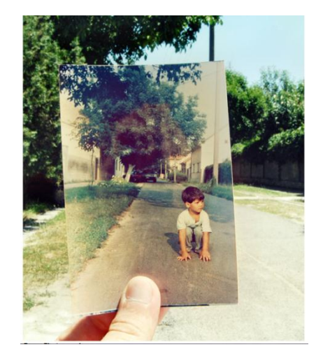
Figure 6b Dear Photograph 'Oh to be young again'

Such is the memorial nature of the photography featured here that many comments are typically simple, poignant tributes to loved ones in the picture. It is not a surprise that Dear Photograph has been a huge success for its creator, the reflective and fun nature of the site plays with ideas about images, past and present, in a creative and simple way. However there is also a deep paradox in its popularity as it essentially relies on the paper photograph for its content to then digitally distribute the image to a wider online audience. The photographs that feature on the site have been created with the sole purpose of appearing on there and, somewhat ironically, will never be printed but they might be kept<sup>6</sup>.