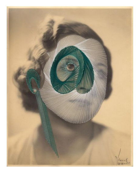
Figure 1a Maurzio Anzeri's Yvonne (2011) Embroidery on photograph