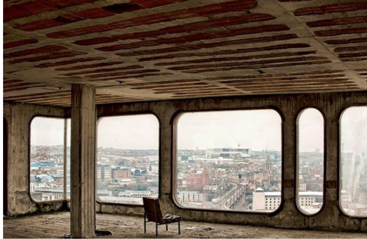
Plate 2 David Warren 'Room with a view' Copyright All rights reserved