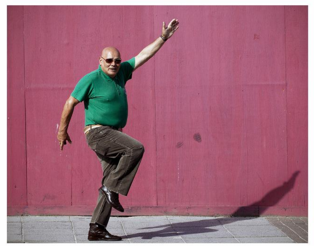
Plate 8 Richard Hook 'Gateshead' Copyright All Rights Reserved