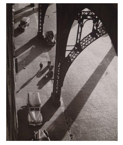
Figure 5b . Kertész, West 134<sup>th</sup> Street, New York, 1944

The photographs taken by Andre Kertész (Figures 5a and 5b) are both of empty streets but here the photographer appears to revel in the emptiness as an opportunity for contemplation. The mysterious and unseen details of everyday life are allowed to rise up to the surface and shake the viewer to attention: long shadows, pavement markings, iron railings and girders, open car doors. Writing later about the photographs of Kertész, Seamon (1990:32) reflects that: