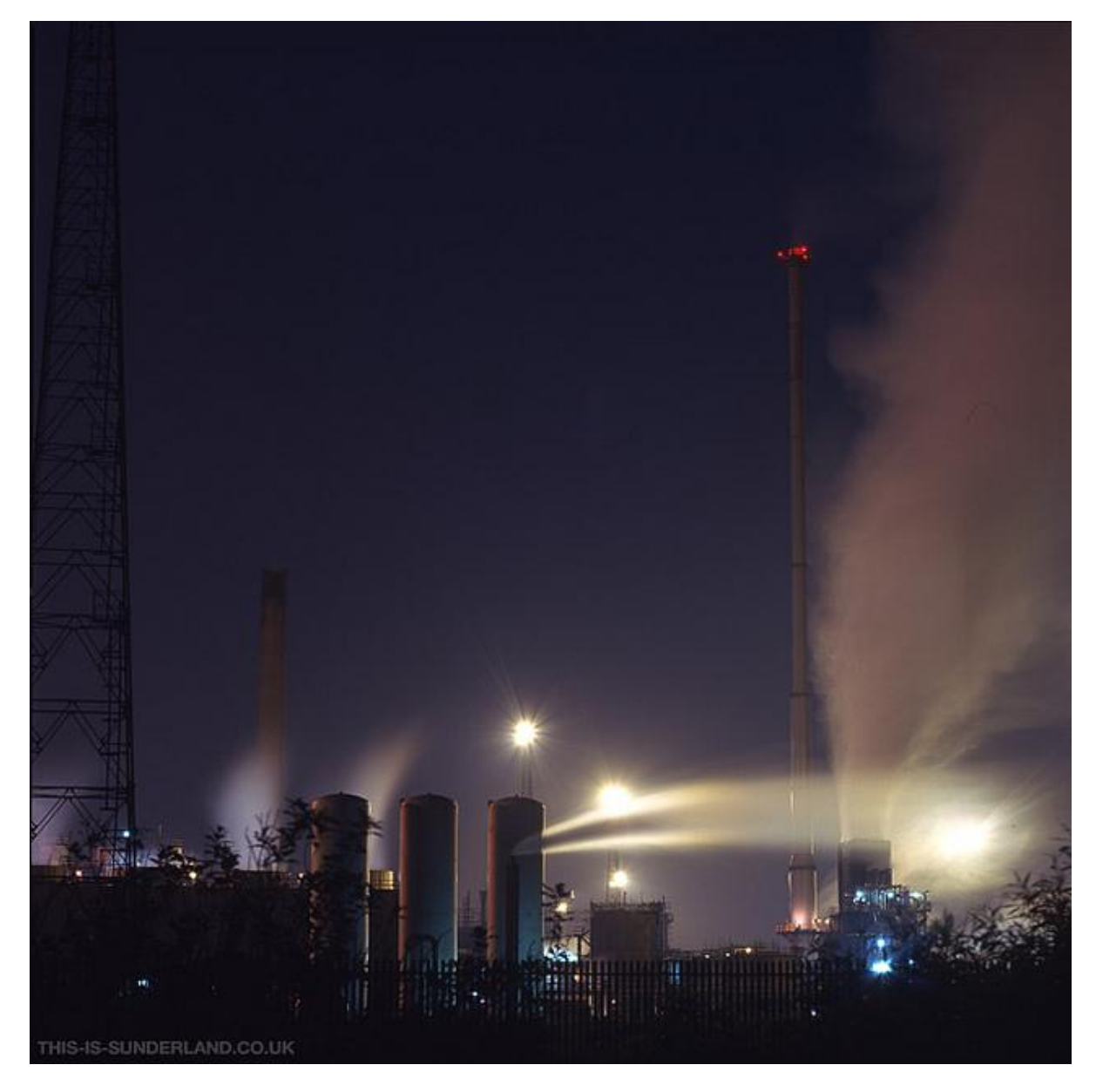
Plate 7 Andy Martin 'Corous Steel works by South Gare' Copyright All rights reserved