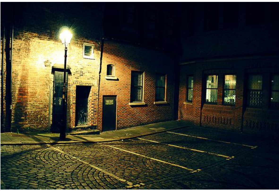
Plate 1 Tom Ellefsen 'Quiet Geordie Nights' Copyright All rights reserved