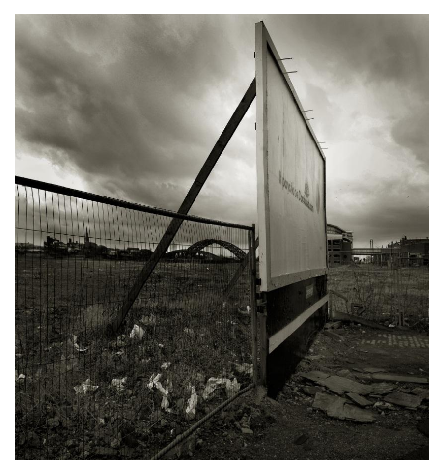
Plate 11 the Understudy 'Vaux Confused' Copyright All Rights Reserved