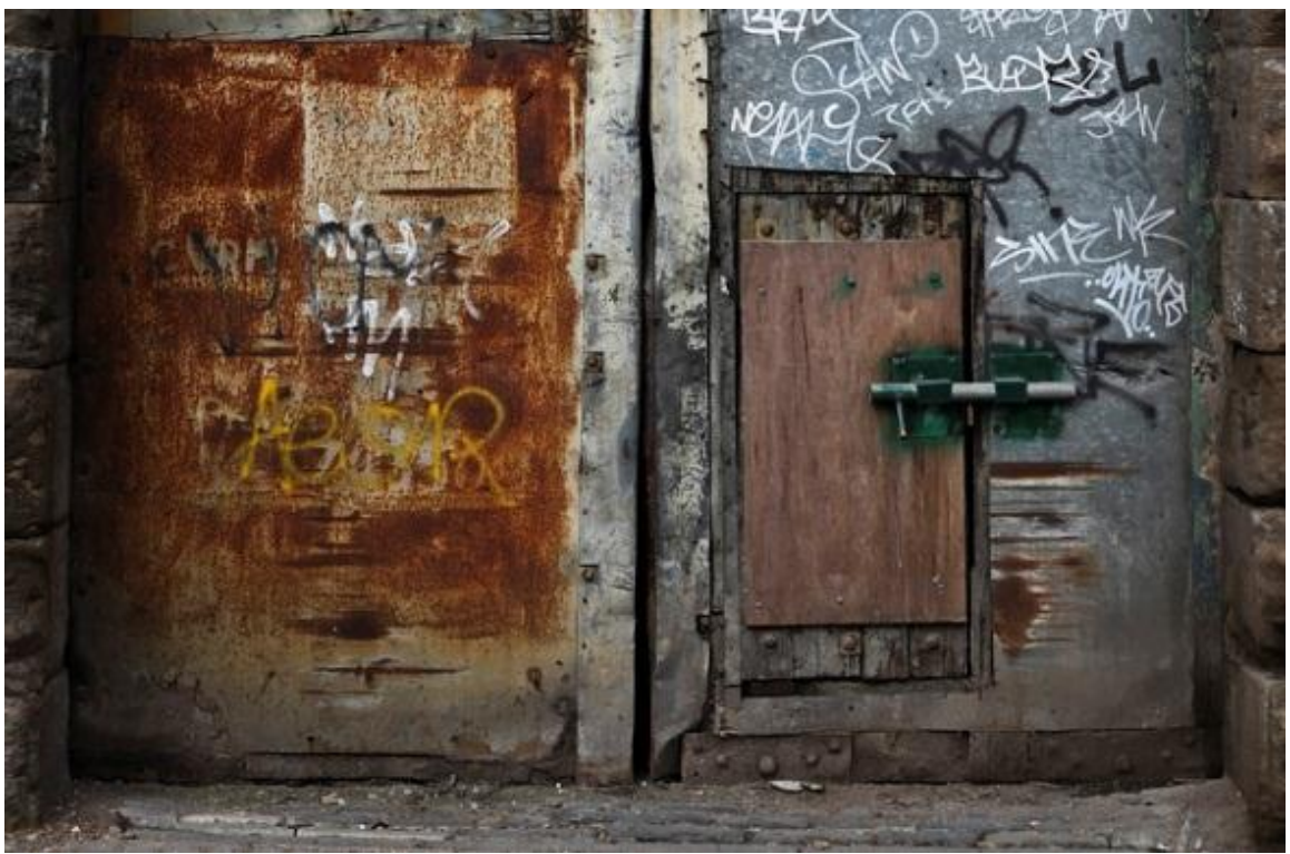
Plate 5 Anthony Dorman 'The Doors' Copyright All rights reserved