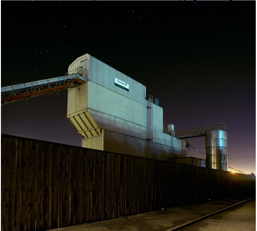
Plate 12 the Understudy 'Tarmac' Copyright All Rights Reserved