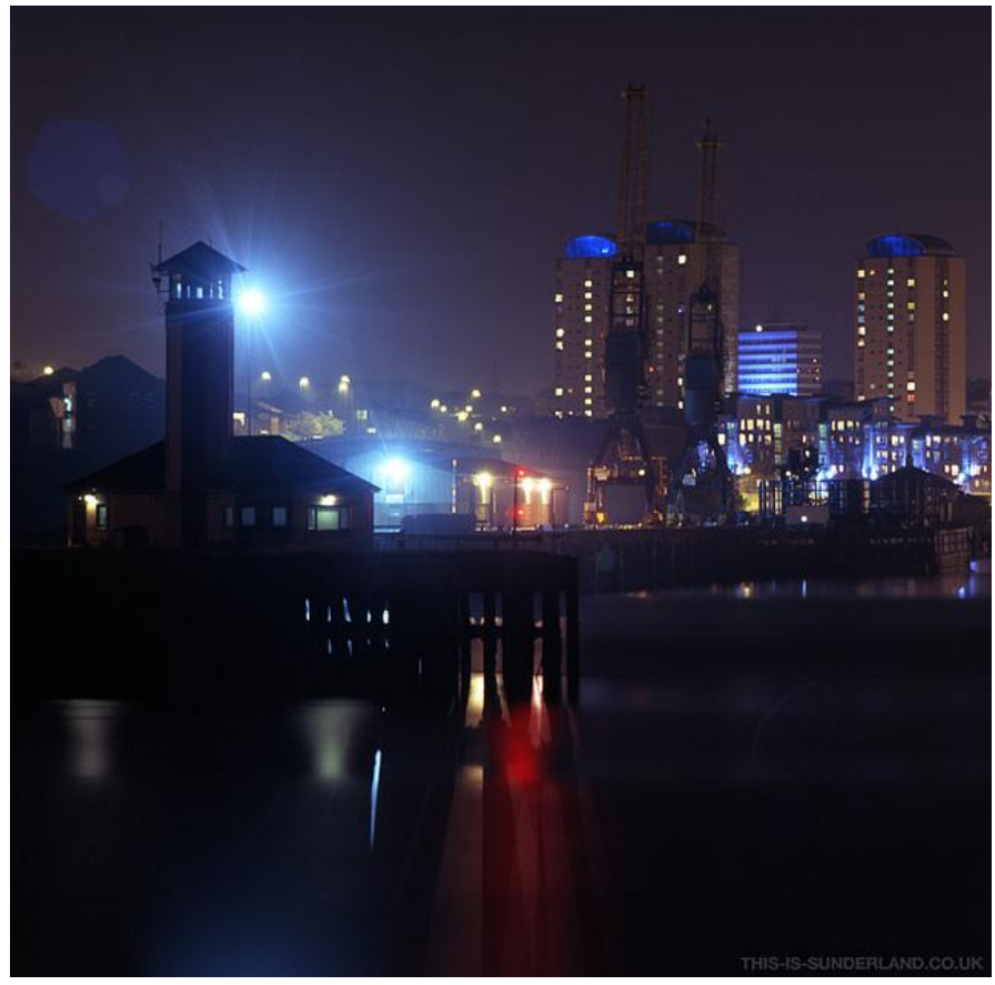
Plate 6 Andy Martin 'Inner City Blues' Copyright All rights reserved