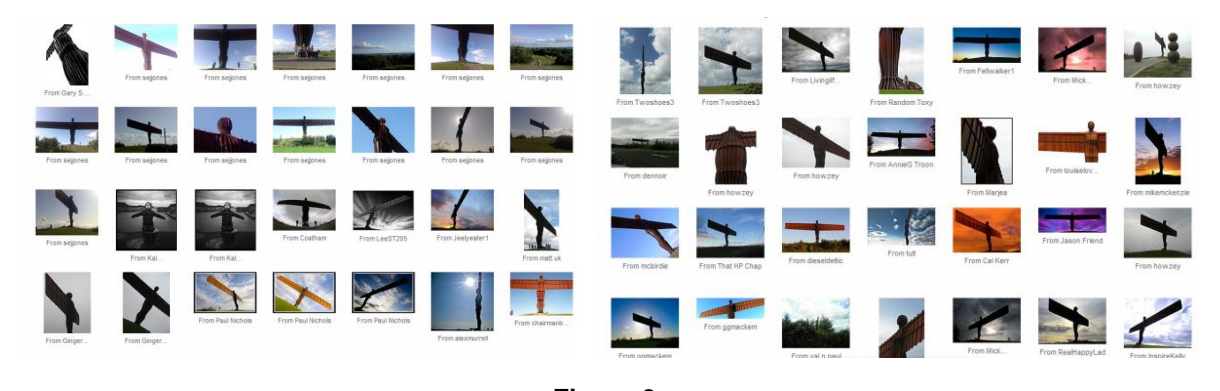
Figure 2 Selection of pictures on Flickr tagged with Angel of the North 'representing the environment they are part of' (Pink, 2011a:9)

Despite their single nature, when images are taken together one can easily get a grasp of the collective work involved which I have attempted to illustrate in Figure 2. This shows screen grabs of pages that contain images tagged with the phrase 'Angel of the North'. When these are put together, an overall picture emerges of the sculpture and different interpretations by photographers of what is a very popular local landmark. The different perspectives collectively become one picture showing the same subject but each photograph is a singular object and until it is put into the group of choice, floats by itself.