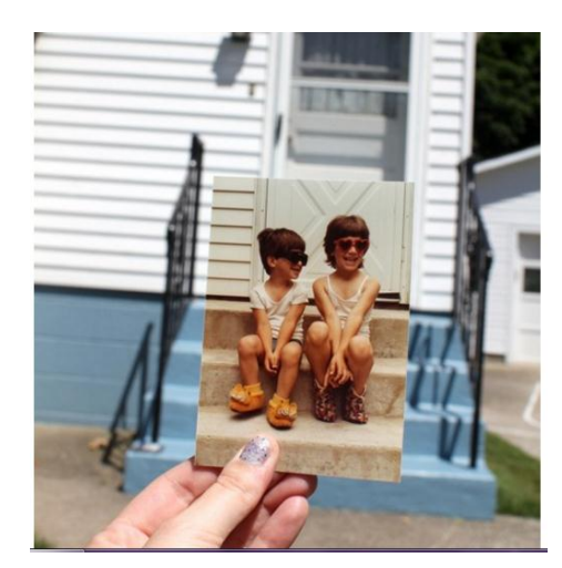
Figure 6a Dear Photograph 'There's a reason we had to'

The name of this section is taken from the title of a website asking users to 'take a picture of a picture from the past in the present' (Figures 6a and 6b)<sup>5</sup>. The pictures featured are mostly family photographs or pictures of the photographer as a child, re-photographed in the present day. The site also asks the photographer for a sentence to go along with the image that begins with the words 'Dear Photograph.'