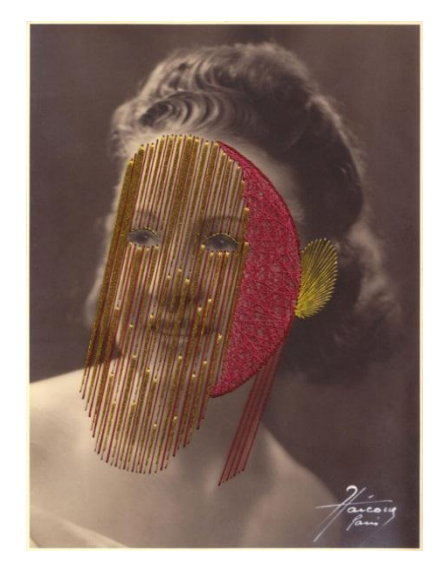
Figure 1b Maurzio Anzeri's Nicola (2011) Embroidery on photograph

The mediums of photography and embroidery are rarely combined, however when seeing the intricate artworks of Maurzio Anzeri (Figures 1a and 1b) where thread is directly sewn into the surface of the picture, the possibilities are striking. Anzeri finds his anonymous portraits in flea markets and works on the photographs for a long time, first laying tracing paper on top of the image to design his embroidered 'mask', to finally making the small holes in the photograph and then gradually layering the threads over the top. What is most striking about Anzeri's pictures is that although the threads are singular in form, the pattern builds in such a way so that from a distance they take the appearance of a solid shape (for example the crescent shape, coloured red on the face of 'Nicola'). Looking closely at the pictures, we can see each individual hole that Anzeri has made in the paper, the colours of the single threads and the details underneath the embroidery of the photograph itself.