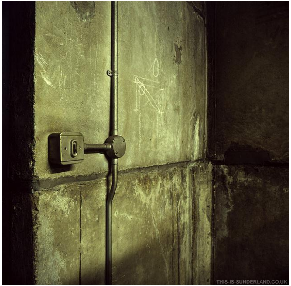
Plate 4 Andy Martin 'Flick my switch' Copyright All rights reserved