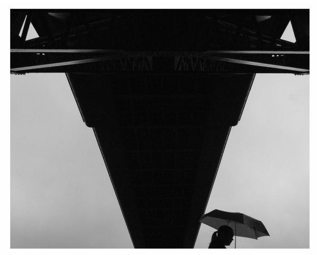
Plate 9 Richard Hook 'Untitled' Copyright All Rights Reserved