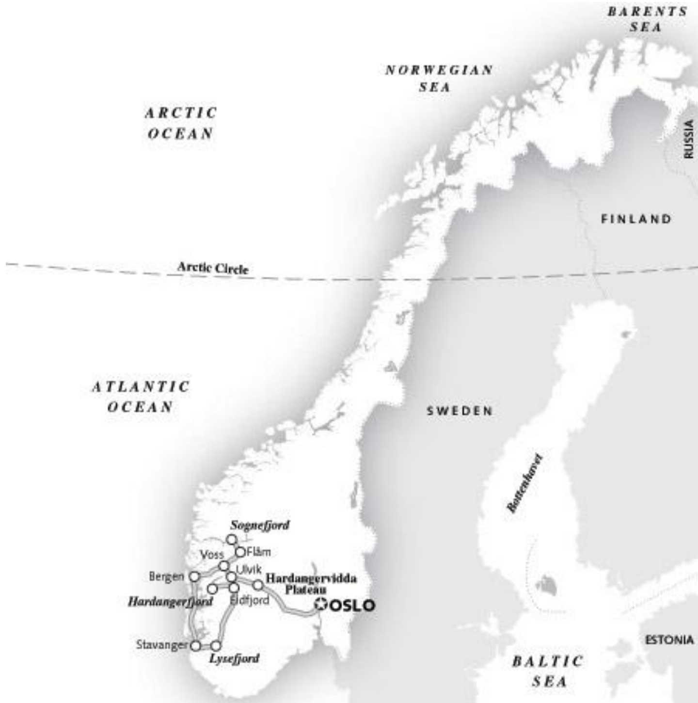
Fig. 1. 'Norway in Microcosm', copyright Lonely Planet 2005 .