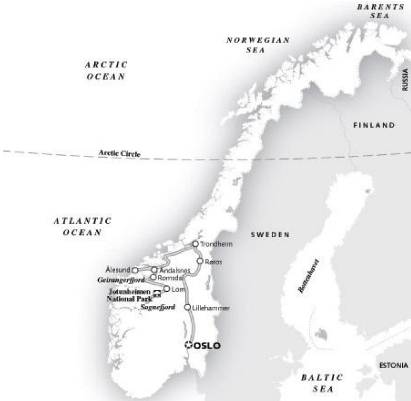
Fig. 2. 'Heart of Norway and the best of the Fjords', copyright Lonely Planet 2005