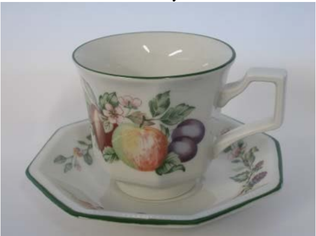
Fig.4. Johnson Bros 'Fresh Fruit', cup and saucer porce lain, purchased 2008.

The next outsourcing example exists where the Staffordshire brand name and 'England' are provided within the indelible backstamp, but the detachable label, or the packaging indicates a Far Eastern place of manufacture. In the manner of Lash and Urry's view, the marketing (or backstamp) creates links with the UK. The word 'England' has in these circumstances come to signify the origin of the brand, rather than place of production. A Johnson Brothers' cup and saucer demonstrates this trend. The printed backstamp reads 'Johnson Bros England 1883' (the year the firm was founded), but the detachable label indicates that it was actually manufactured in China (Figure.4-6).