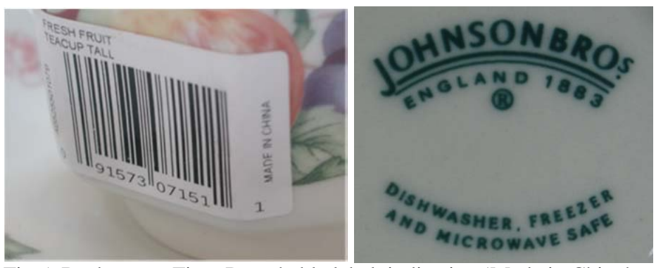
Fig.5. Backstamp. Fig.6.Detachable label, indicating 'Made in China'.

A third more unusual trend is for Staffordshire brands, such as Churchill China, to declare in the indelible backstamp that the product was 'Made in China'. A fourth trend has been a shift from stating 'Made in England' to 'Designed in England' to reinforce UK links, without any indication of place of manufacture on detachable labels, or packaging. A fifth approach is to declare 'Decorated in England' which is a reflection of UK firms using imported white-ware, normally from the Far East. Finally, the sixth trend can be a more ambiguous approach whereby one Staffordshire company called, 'Rose of England China', stated on their packaging that mugs were 'Made in England', whilst the mugs themselves are individually marked 'Rose of England, Made in China' (Figure 7-8).