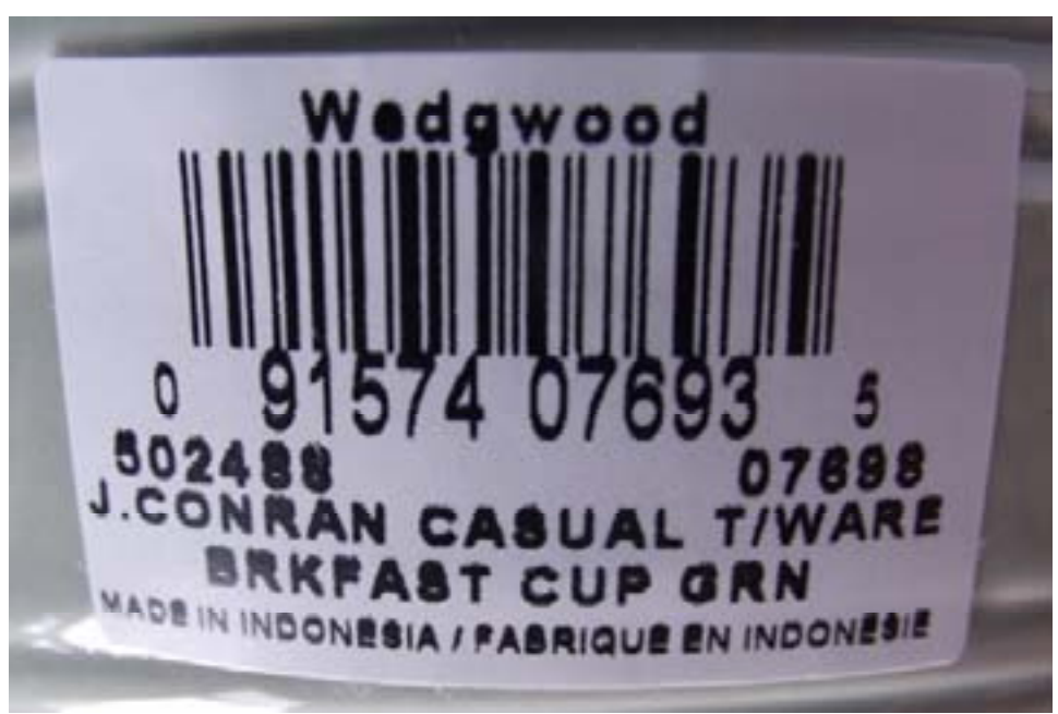
Fig.3. Detachable label, 'Made in Indonesia'.

The next outsourcing example exists where the Staffordshire brand name and 'England' are provided within the indelible backstamp, but the detachable label, or the packaging indicates a Far Eastern place of manufacture. In the manner of Lash and Urry's view, the marketing (or backstamp) creates links with the UK. The word 'England' has in these circumstances come to signify the origin of the brand, rather than place of production. A Johnson Brothers' cup and saucer demonstrates this trend. The printed backstamp reads 'Johnson Bros England 1883' (the year the firm was founded), but the detachable label indicates that it was actually manufactured in China (Figure.4-6).