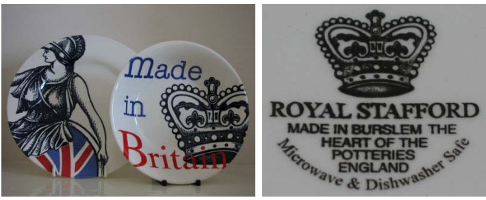
Fig.11. Royal Stafford Tableware, 'Britannia' Fig.12. Backstamp. range, tableware, earthenware, c2009.

In reality, maintaining production in Stoke-on-Trent stemmed from Bridgewater's desire to create jobs in the UK. Similarly, a Staffordshire firm called Royal Stafford Tableware has created backstamps that emphasize the Potteries and even surface pattern designs incorporating the phrase 'Made in Britain'. This is another example of a type of marketing strategy that has emerged reflecting the impact of globalization (Figure 11-12). However, the Managing Director of Royal Stafford, when interviewed, established that the motivation for continuing production in the UK stemmed from maintaining design and manufacturing agility issues, rather than a perceived consumer demand (Interview 4).