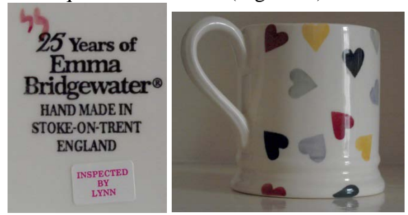
Fig.9. Emma Bridgewater, sponge Fig.10. Backstamp for 2010. decorated, mug, earthenware, 2010.

cultures, heritage, identity and continuity becoming re-valued (Corner and Harvey (ed), 1991, p.24-6). Bridgewater markets a diverse range of surface patterns, often using hand techniques of decoration (Fig. 9-10).