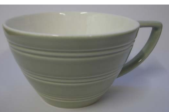
Fig.1. J.Wedgwood, designed by Jasper Fig. 2. Backstamp, 'Jasper Conran at Conran, cup, earthenware, purchased 2009. Wedgwood'.