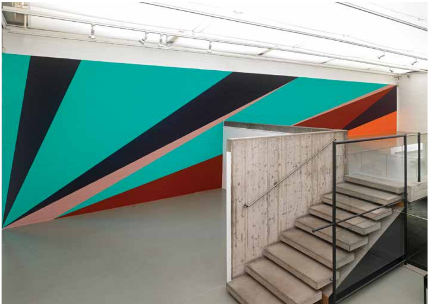
Flucht in den Norden