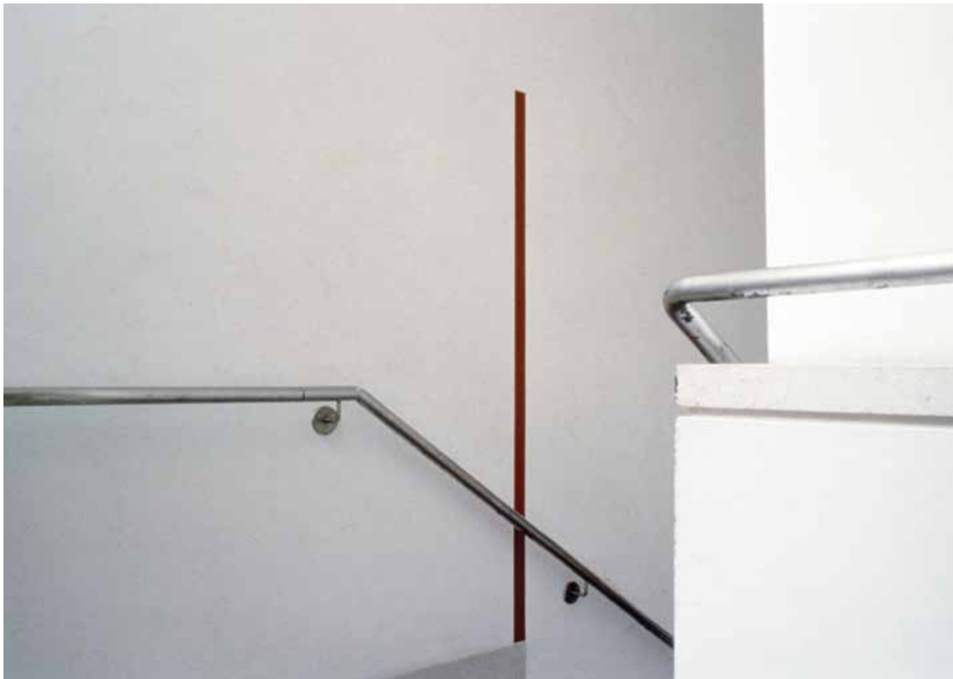
Step by step on different levels