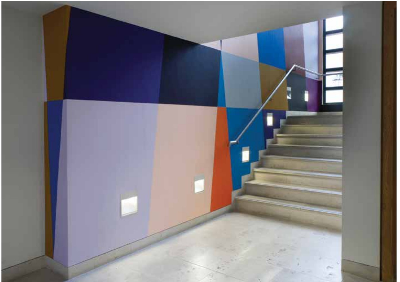
Composition for a Staircase