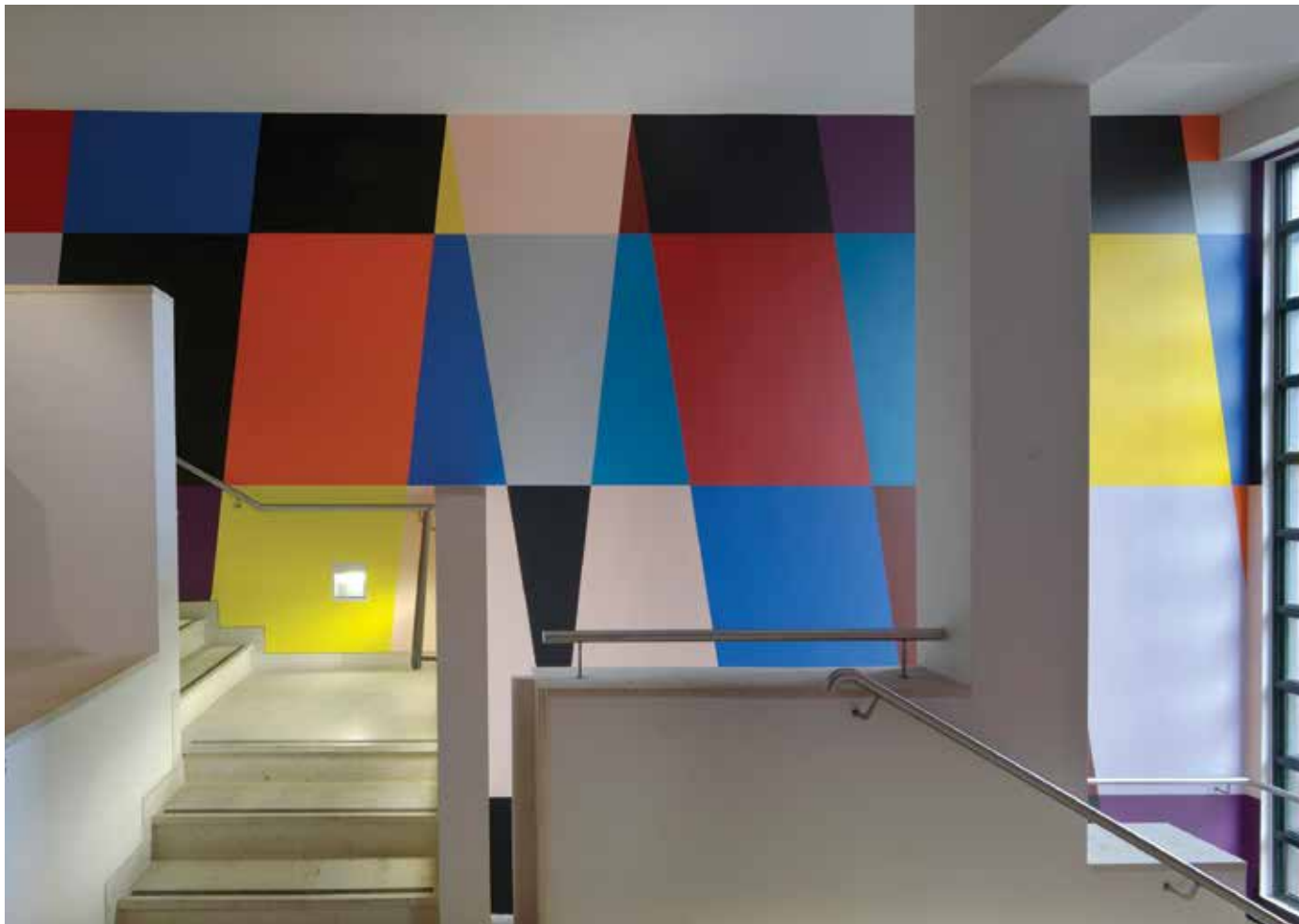
Composition for a Staircase