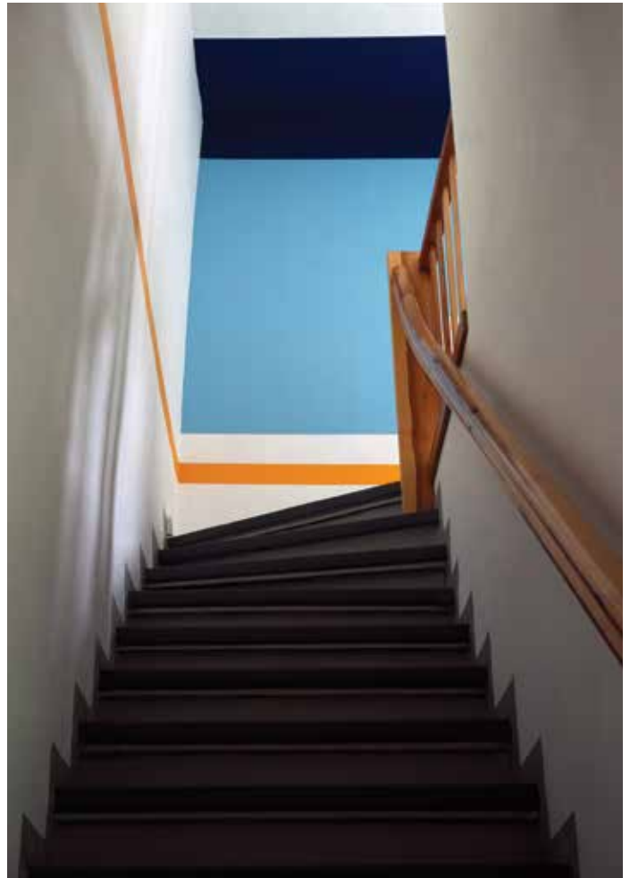
Wet paint – oben wie unten