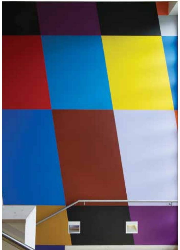
Composition for a Staircase