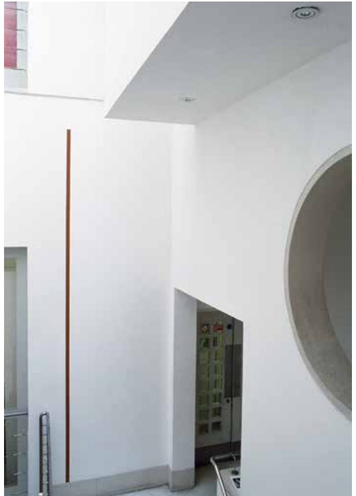
Step by step on different levels