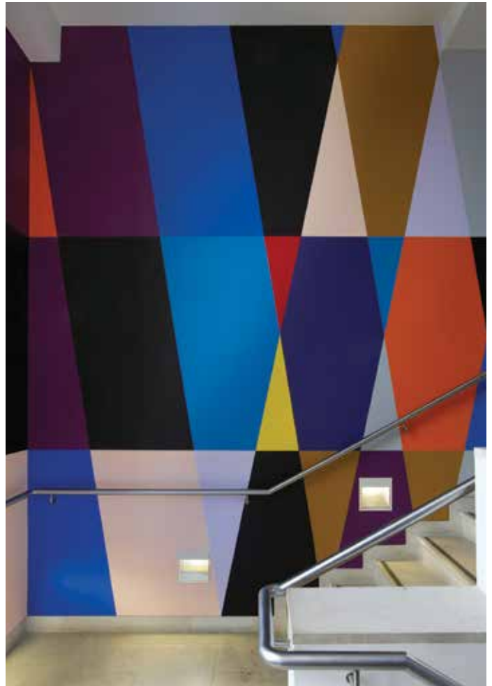
Composition for a Staircase