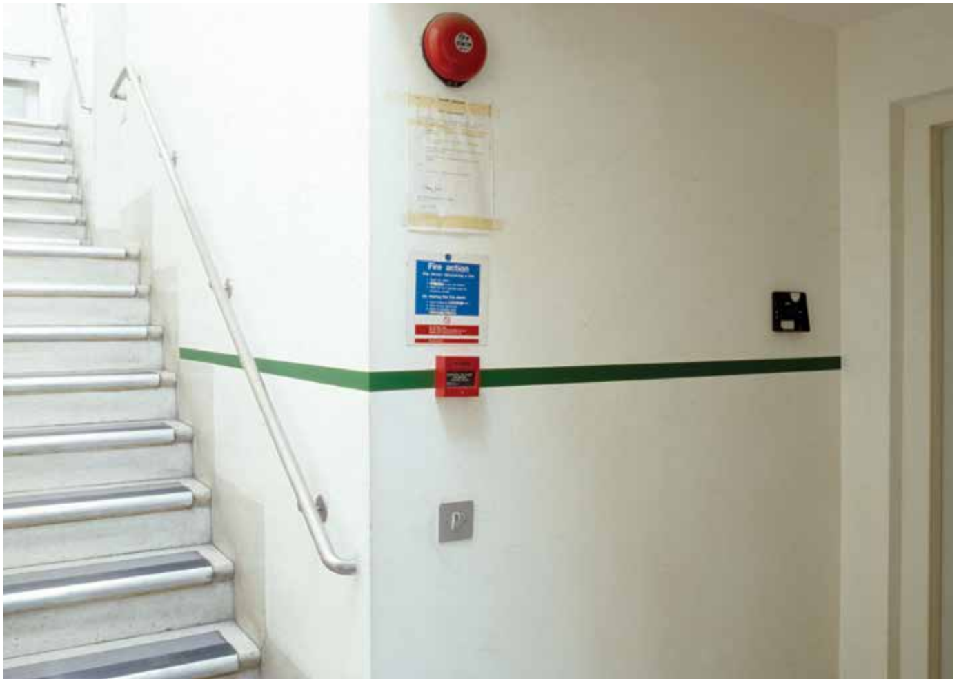
Step by step on different levels