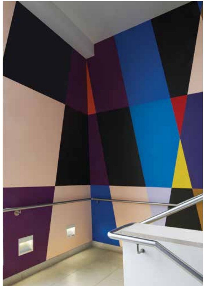
Composition for a Staircase