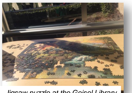
Jigsaw puzzle at the Geisel Library