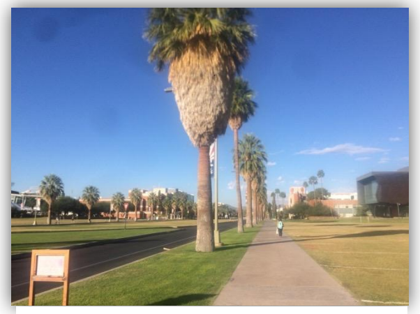
University of Arizona campus

The University of Arizona (UA) has four campus libraries. I was able to visit the Main Library and Special Collections and the Health Sciences Library. My visit took place on the same day as the Arizona Library Association Conference and although some staff were attending the conference I was still able to speak to quite a few members of staff at the main library and Health Sciences Library. I began the day by having breakfast with some librarians which was an excellent opportunity to chat with them about their roles and share my own experiences too. I was then able to meet with some individual members of staff to discuss their specific areas in relation