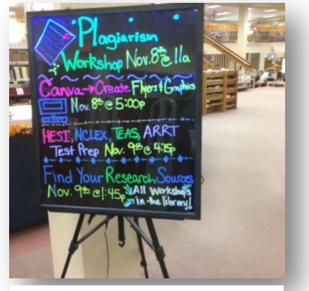
Display at library entrance

at the entrance to the library promoting the upcoming skills workshops taking place. This is updated regularly to communicate with students. Upcoming library events are also promoted via a calendar on the library web page. In our discussion meeting we talked about the practicalities of arranging and staffing library instruction when you have quite a small staff. The library asks for 7 days notice from academic staff for organising instruction classes. Academic staff must submit a form to request a session. The amount of instruction that librarians do is mapped, so that work can be shared out for example teaching outside of usual hours.