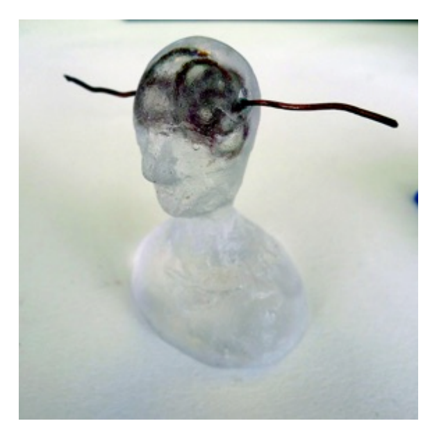
Figure 8 Liz Waugh McManus, Glass Head (IOT object), cast glass, copper wire and Arduino.

The text is mounted onto a sheet of glass and when a word is touched a voice can be heard saying the word. The words are mounted onto opaque white glass. Behind each word, on the back of the white mounting sheet, is a strip of copper which is linked to a Touchboard, which then played the spoken sounded clips recorded by the artist through a small speaker.