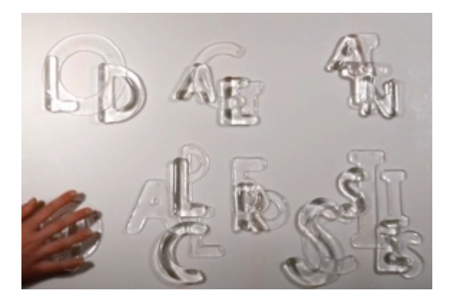
Figure 7 Tina Webb, Old Age Ain't No Place for Cissies, kilnformed and glued glass, copper, Touchboard and speaker

'Exploring and experimenting with the qualities of glass, observing how glass reacts when hot fused and investigating the possibilities of conductivity has inspired me to develop my research ideas incorporating textiles and using the new knowledge acquired in this workshop'.