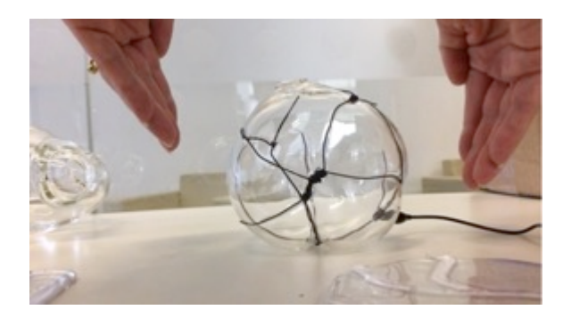
Figure 4 Louise Mackenzie, Biotechnological Vessels of Nur/torture, blown glass in copper wire, touchboard and speakers

and will inform what I would design and make with future projects.