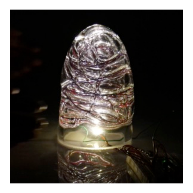
Figure 3 Colin Wilson, Caged blown extruded shape, blown glass with copper, arduino, light