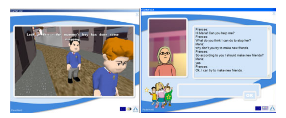
Figure 1 FearNot! screenshots of male verbal bullying episode and female making new friend user interaction episode (English version)