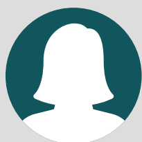
Figure 1. Vignettes of the women