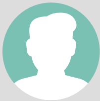
Figure 2. Vignettes of the men