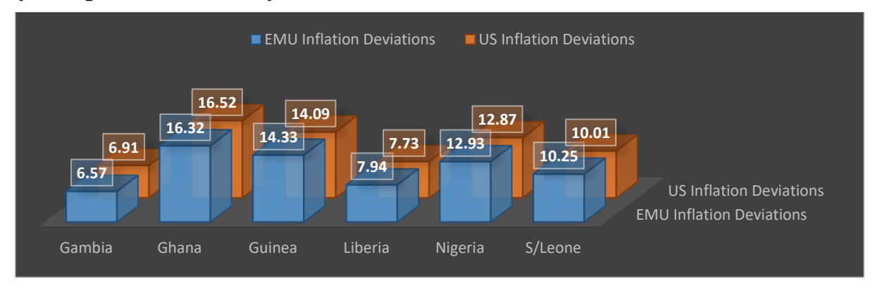
Figure 3: WAMZ Countries' Inflation Deviations from EMU and US Inflation Rates (Convergence Criteria Period)