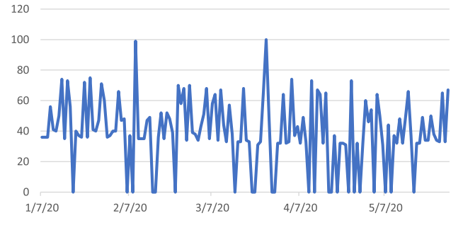
Fig. 3. Google Trend data search query for the MeSH term 'self-administration'.