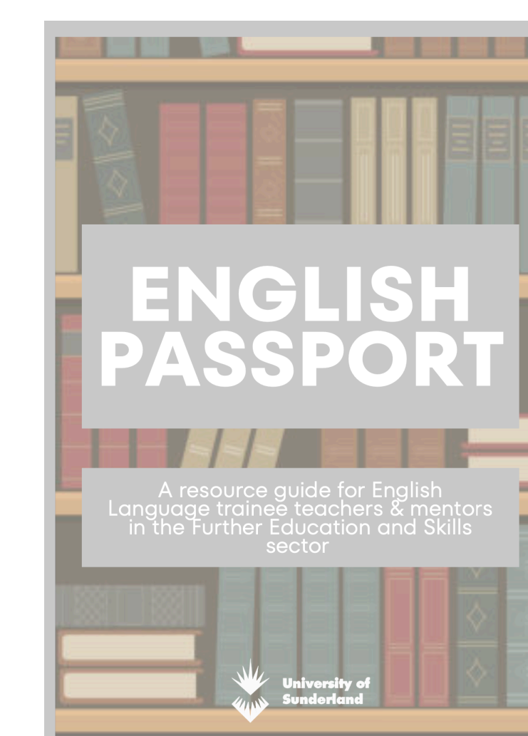
PGCE FES English Passport (2024)