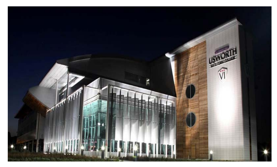
Photograph of Sixth Form U

This information is quoted from the website, but it does beg the question as to when did a 'street scene' and 'open air café' become conducive to an academic and scholarly ethos? Sixth Form U is located near to a mixed Roman Catholic school which has recently expanded its sixth form provision to take up to 300 students, with 150 year 12 pupils from other schools.