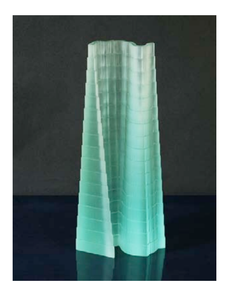
Brian Thompson Northern Rivers; Wear at NGC 2012 UV Bonded Float Glass 32.8 x 15.2 x 9 cms (Collection: The Artist) Weight: 3.7 Kgs