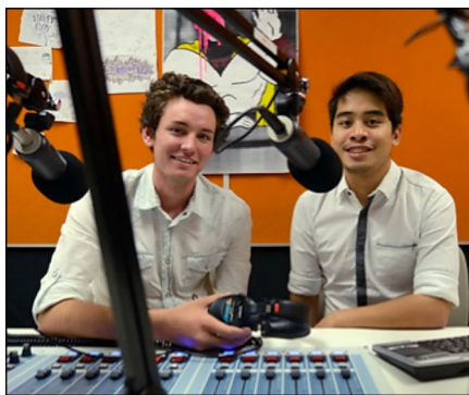
Students participating in the global Television Media Lab at UQ