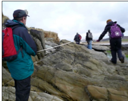
Images show geology students working along the coast near Ballyferriter, The Dingle Peninsula, Co. Kerry, Ireland. This is a 4 day residential field-based experience. The small groups all come back to the field base in the evening to discuss their findings.