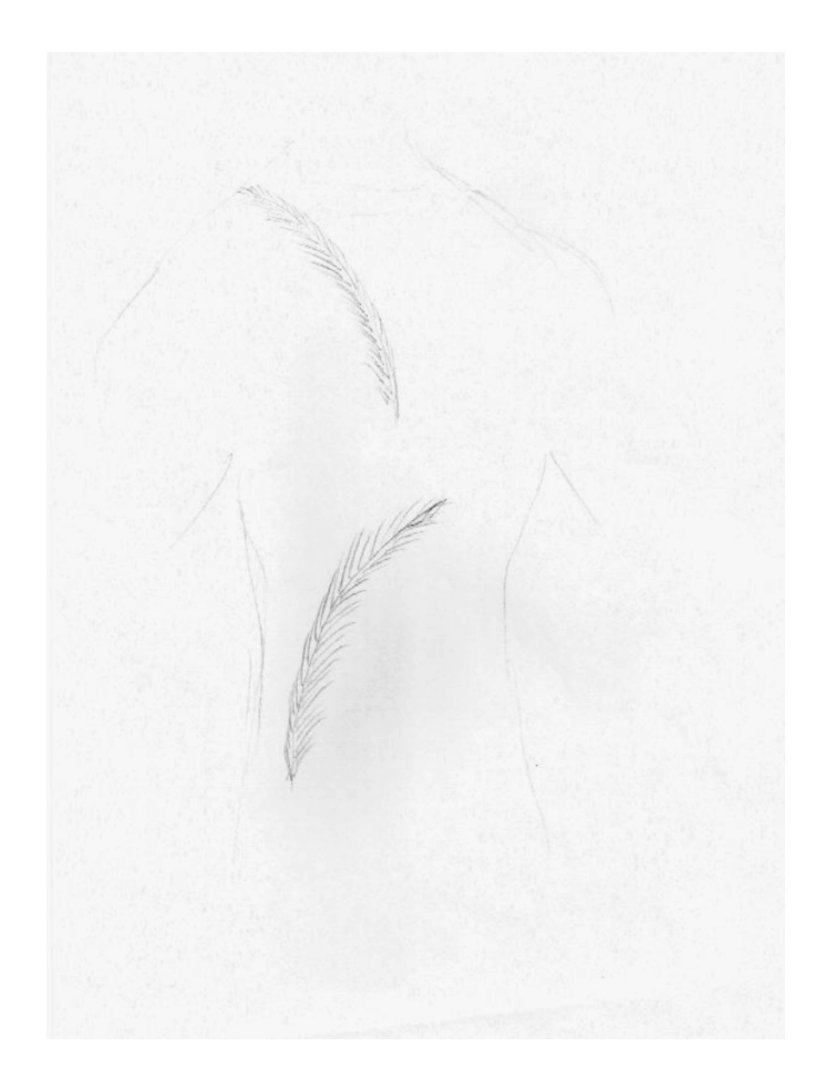
Figure 2. Pencil drawing by unnamed grand gestures dancer

(Alt Text for Figure 2. Pencil drawing showing outline of torso with large feathers superimposed)