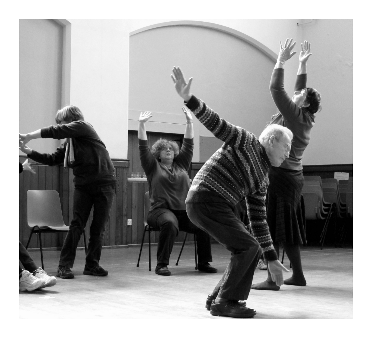
Figure 5: Grand Gestures improvising.

(Alt text for Figure 5. Black and white photograph of five dancers improvising)