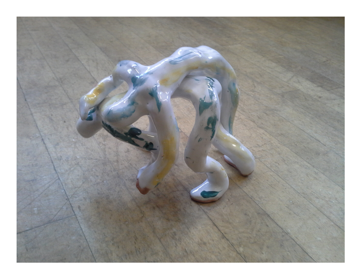
Figure 4: Pottery figures by dancer Lillian Read.

(Alt text for Figure 4. Photograph of glazed pottery sculpture of two figures, their forms moulded together as one takes the weight of the other on its back)