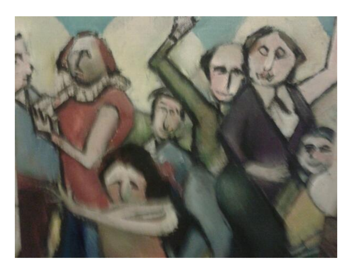
Figure 3: Grand Gestures Dancers, painting by Walter Watthews. Oil on cotton duck.

(Alt text for figure 3. Painting showing seven dancers in motion)