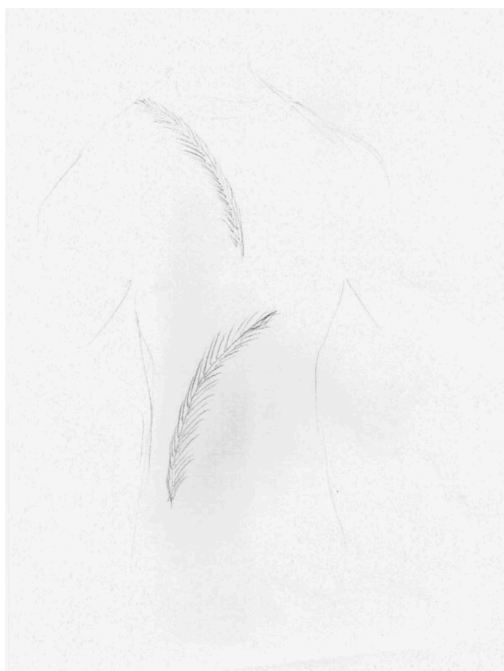
Figure 2. Pencil drawing by unnamed grand gestures dancer

Grand Gestures use a range of media to communicate about, reflect on and extend their dance practice: Drawings, sketches and paintings are made in and outside of their journals, sometimes posted online; tactile pottery figures and pots are made; photographs are taken, and films have been produced. This section will examine a range of these things.