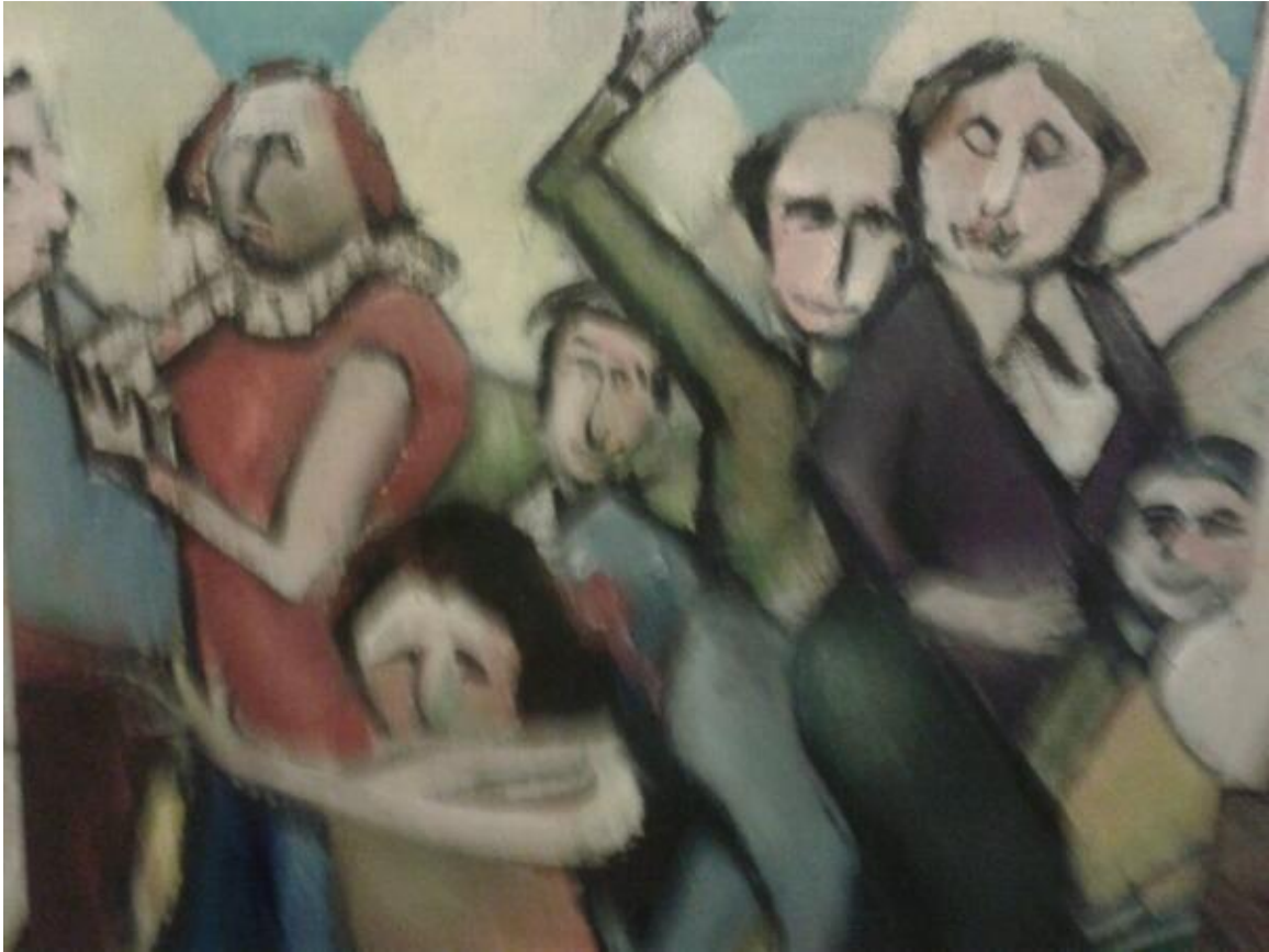
Figure 3: Grand Gestures Dancers, painting by Walter Matthews. Oil on cotton duck.

Unlike the previous drawing, the painting in Figure 3 was not produced in the immediate context of the dance session itself, but separately and, as an oil painting, over a longer period of time. Grand Gestures dancer Walter Matthews is a prolific painter and has produced many evocative images, sketches and oil paintings of the dancers in action. This example, chosen by Walter for this report, evokes the energy of the group of dancers moving together.