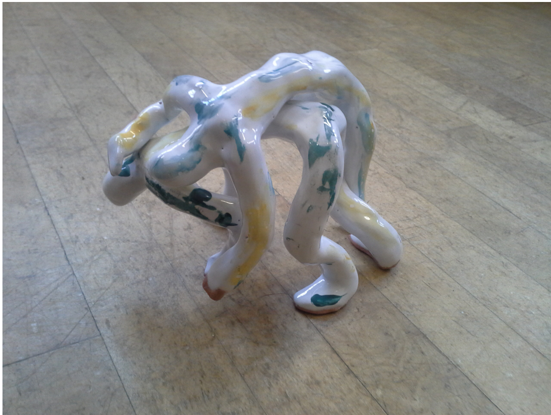
Figure 4: Pottery figures by dancer Lillian Read.

Dancers Lillian Read and Linda McGeever were both potters before they started dancing, and both explore through clay some of the somatic, tactile, movement and visual elements found in their dancing. Figure 4 shows a photograph of a pottery figure that was posted on the Creativity Matters blog, and is described there as 'dancer Lillian Read's creative response to a Grand Gestures session exploring the nature of touch and the giving and taking of weight'. (2014)