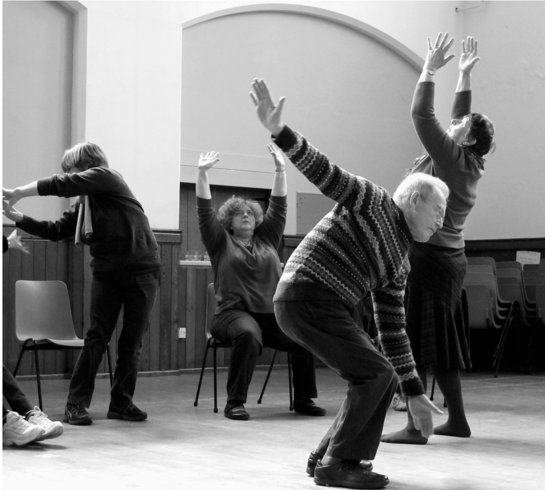
Figure 5: Grand Gestures improvising.