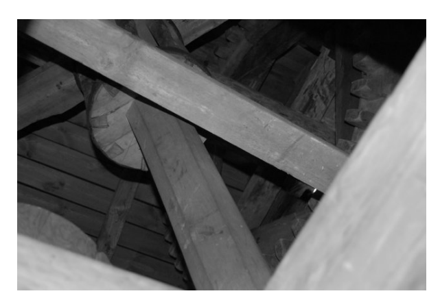
Figure 2: Old traditional gearbox opened for checking the wear of gear teeth

In the real industrial world the most reliable way of monitoring wear is to measure wear as such (Figure 2). Unfortunately, this approach cannot often be followed since the components of interest are hidden and thus cannot be monitored with low cost solutions. In fact the wear monitoring solutions could become extremely expensive and also be prone to fail easily. Due to the fact that it is not easy to monitor wear as such indirect methods to define the amount of wear are often used. The most common method is the measurement of vibration acceleration. A good CBM application on the assets will result in a large amount of sensor data. This data can take various forms including velocity, acceleration, acoustic emission, etc. In addition, utilising the Internet of Things (IOT) techniques will allow for a greater variety and volume of machine data.