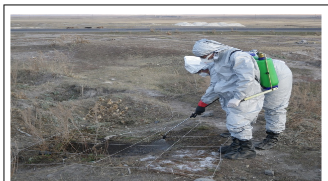
FIGURE 3 | Treatment of test site B with germinants and biocide delivered using a Micropak KS16 backpack sprayer.

Even though the level of natural B. anthracis spore contamination at test site B was relatively low we wanted to take advantage of this unique opportunity to generate real world data. Thus test site B was treated with a regimen comprising a mixture of germinants followed 1 h later by PAA at a concentration of 5000 ppm which was the maximum concentration permitted by the Turkish authorities, delivered using a back pack sprayer (Figure 3). An advantage of this system is the ability to specifically target the delivery of the