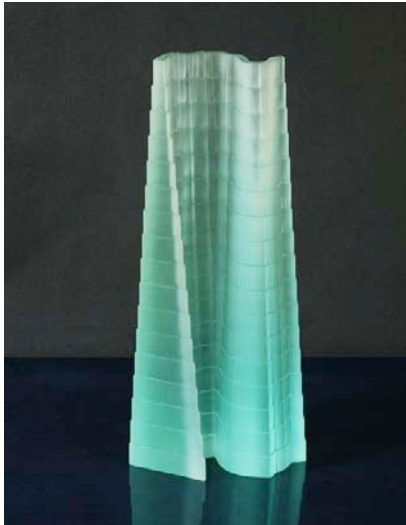
Brian Thompson Northern Rivers; Wear at NGC 2012 UV Bonded Float Glass 32.8 x 15.2 x 9 cms (Collection: The Artist) Weight: 3.7 Kgs