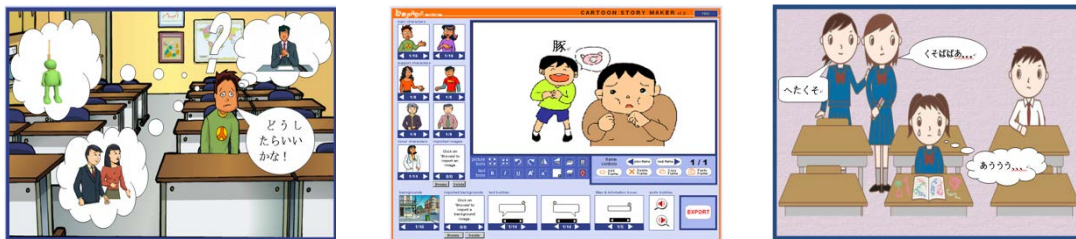
Fig. 2. Digital Storyboards created by children depicting bullying scenarios at school

Shimpai Muyou focuses on empathic engagement between the child and the victim, with Theatre of the Oppressed and Digital Storyboarding generating appropriate dialogue for the bullying scenarios and for engagement with the victim. Digital Storyboards (Figure 2) directly captured language content, gestures and coping strategies that children used to dealing with bullying, character impressions, emotions and empathy.