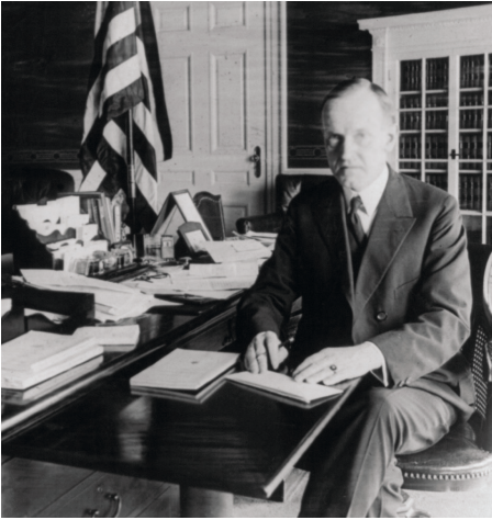
President Calvin Coolidge, who had declared “America must be kept American” in 1923, signed the Immigration Act into law on May 26, 1924.

bill, which he “heartily approved.” If the exclusion provision stood alone, “I would disprove it.” 94 However, there is evidence of an early adoption of racial thinking by Coolidge. As vice president-elect, he wrote an article for Good Housekeeping magazine in which he warned: “There are racial considerations too grave to be brushed aside for any sentimental reasons. Biological laws tell us that certain divergent people will not mix or blend.” 95