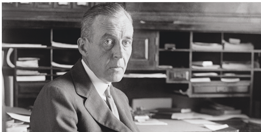
Senator David Reed intended the 1924 Immigration Act to ensure that “the racial composition of America at the present is made permanent.”