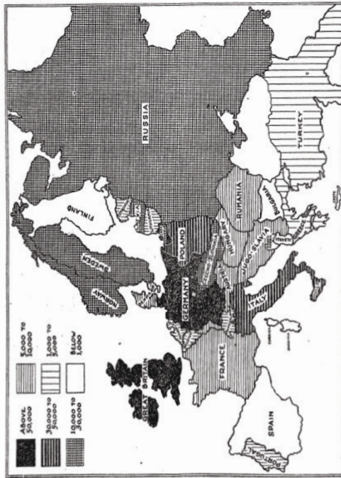
FLOW UNDER THE PRESENT LAW