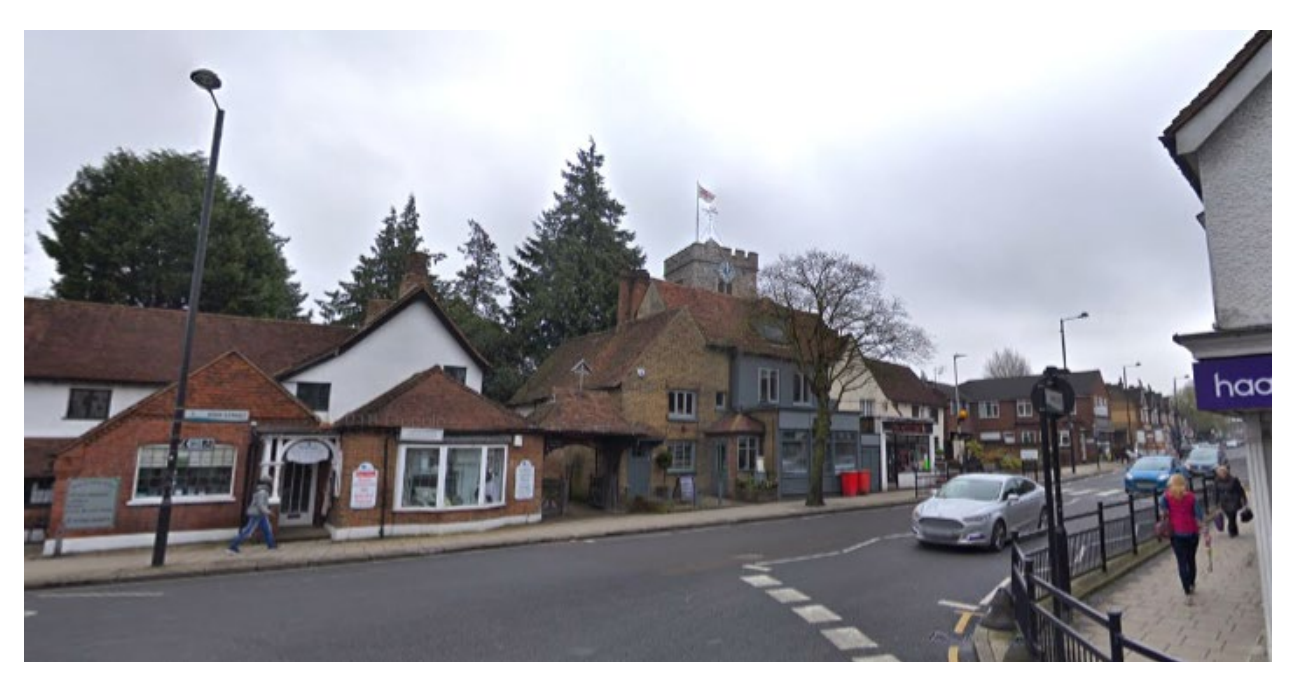
Rosewood High Street (Google Maps)

Bag End or, more specifically, Babinton ward where the host school is located, is in the southern part of the borough. South Hildorien is generally more densely populated and more urban in character. It is also more ethnically diverse. The 2011 census shows that 39.8% of Babinton residents identified themselves as White British background. 3.9% were from Mixed / Multiple Ethnic groups, 37.1% from Asian / Asian British background (including Indian, Pakistani, Bangladeshi and Chinese), 15.4% from Black / African / Caribbean / Black British backgrounds and 3.9% from other ethnic backgrounds (including Arab). Additionally, as many as 42.7% of Babinton ward residents were born outside of the UK (with 57.3% in the UK) (Census 2011 in Business Performance Team Residents Services, 2019).