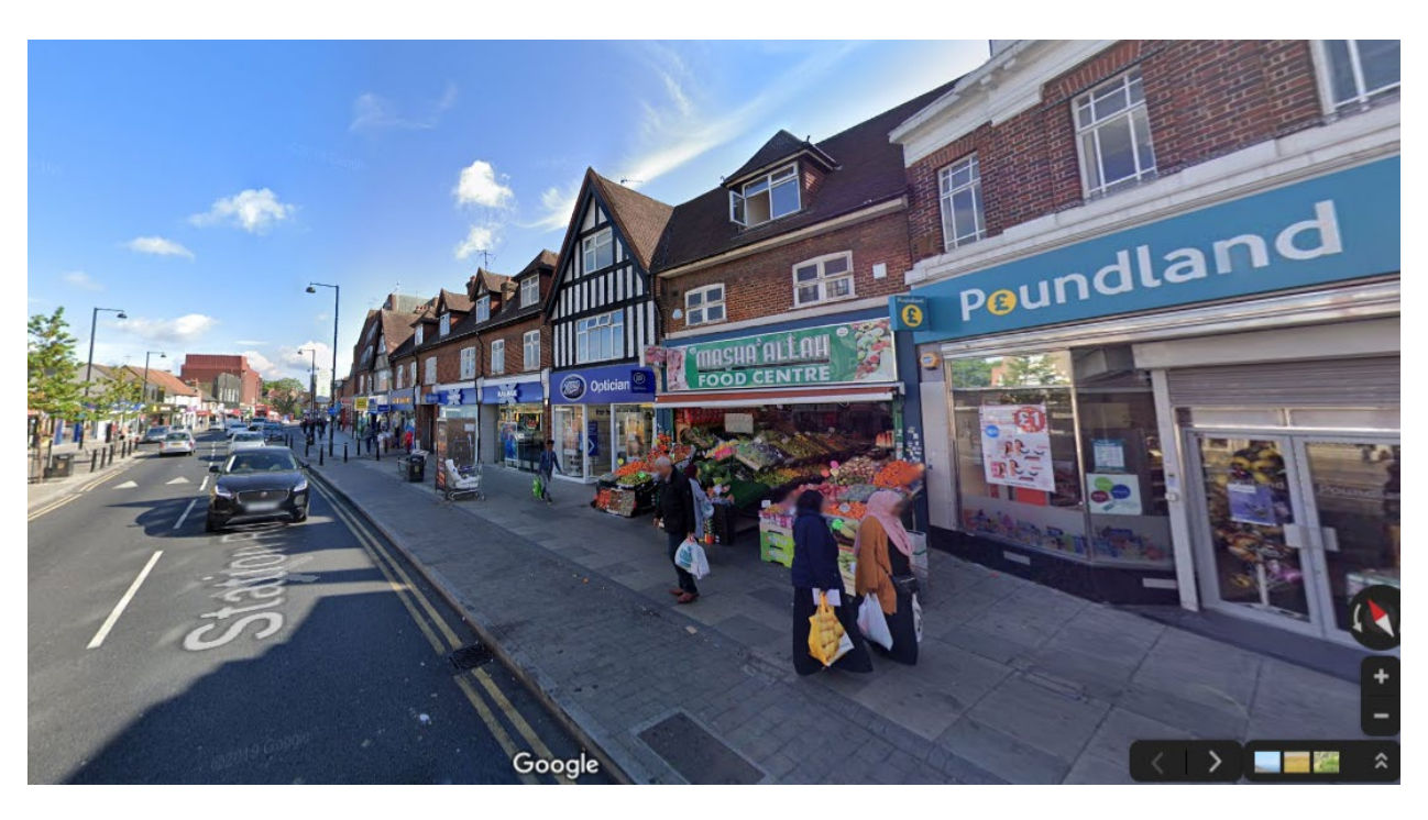
Bag End Town

respectively of the general Hildorien population, these jobs were enjoyed by only 11.5% and 7.8% respectively of Babinton residents. (Census, 2011 in Business Performance Team Residents Services, 2019).