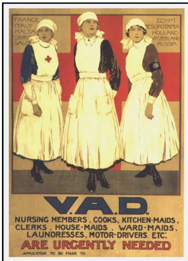
Joyce Dennys (1915).  Art.IWM PST 3268

would be able to be supported by their families, and thus not require payment, but also the moral fortitude of these women was regarded as highly desirable as they would be working in largely masculine company. To emphasise their moral fortitude, their uniforms were designed around those of nuns. The Voluntary Aid Detachment of the British Red Cross (nearly always referred to as VADs), had a standard uniform of a blue dress with a white apron, cuffs, collar, and hat for nursing, emblazoned with the red cross of the organisation. The uniform for other roles was distinguished only by the variation in muted dress colour. A famous poster by Joyce Dennys, herself a VAD nurse, shows three young women who stare innocently and inspirationally outward, with the central woman's gaze directed heaven-ward.