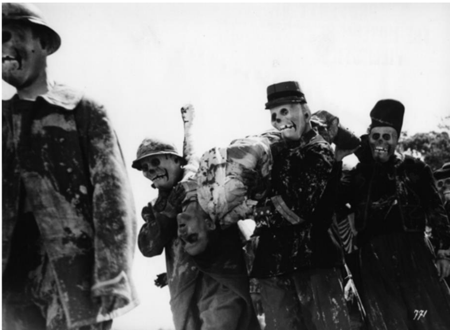
J'Accuse (Abel Gance, 1919)

in a climactic sequence known as ‘the return of the dead’. The film was shot at the end of the war but before the Armistice, and many of the hundreds of extras who took part in the ‘return of the dead’ scene were still serving soldiers who returned to the battlefield in real life after the filming (Abel, 1984). In fact, as W. Scott Pool (2018) has pointed out, many of these ‘extras’ were recuperating soldiers with genuine injuries and disfigurements, needing very little in terms of make-up and prosthetics to make them monstrous. The ‘return of the dead’ scene shows the film’s main protagonist in a state of manic shellshock, seeing his dead comrades rise up from the ground and start their slow march home. Visually, the dead are human but decaying, their faces expressionless with hollowed-out eyes and lips drawn back across gaping mouths.