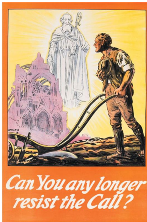
Unknown artist (1915). Art.IWM PST 13637

Religious iconography is not restricted to the use of angels. For example, one British poster from 1915, when voluntary recruitment was trailing off, particularly in Ireland, shows a farmer at his plough (itself a religious metaphor), against the backdrop of a ruined cathedral (recognisable as the medieval Rheims Cathedral, which had been destroyed in the early months of the war). The farmer looks up from his plough to see the ruin with the spectral figure of St Patrick emanating light and carrying a shepherd's crook. The use of recognisable saints, along with angels, is found in many posters produced early in the war.