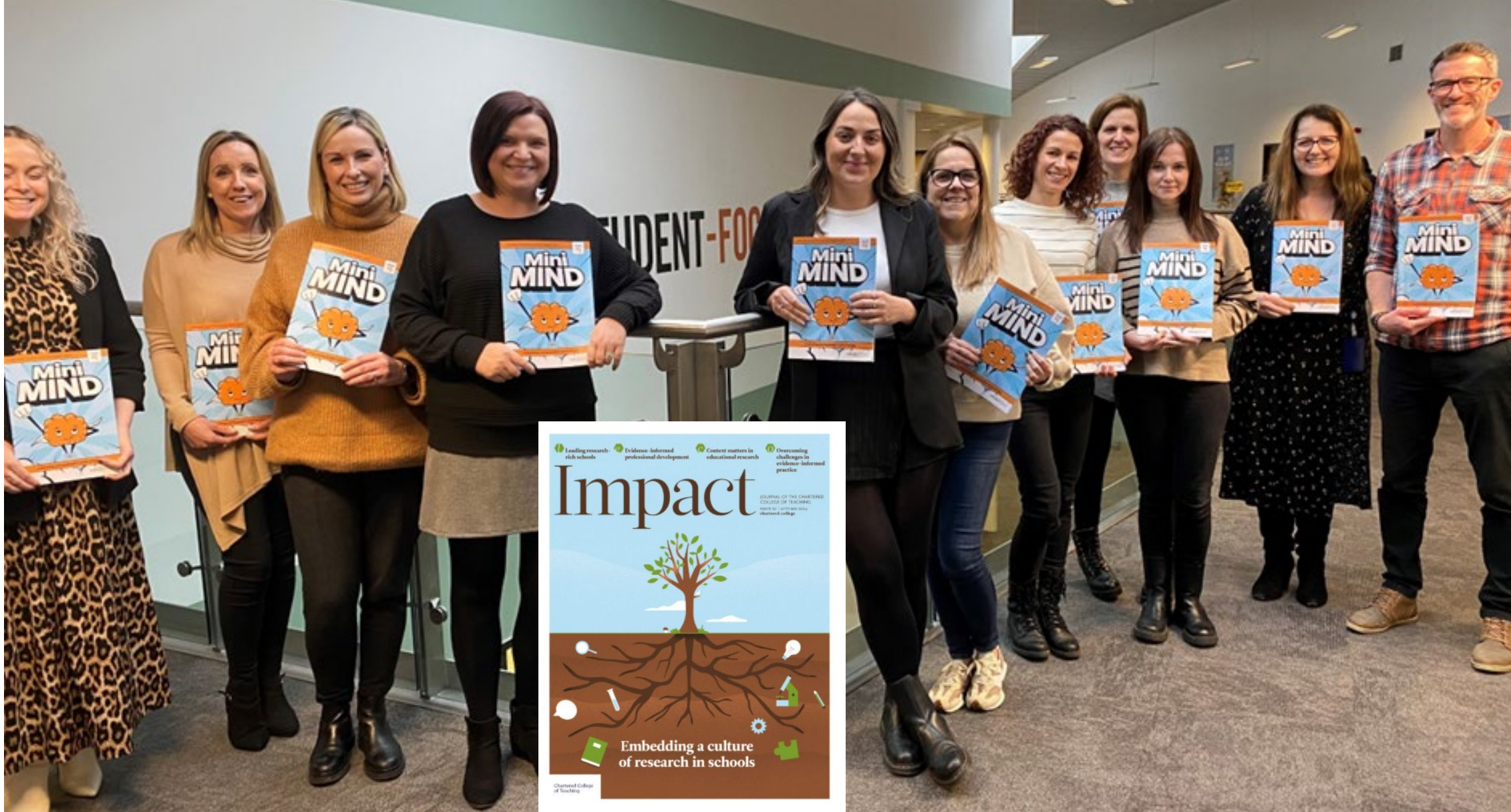
Issue 22: Embedding a culture of research in schools