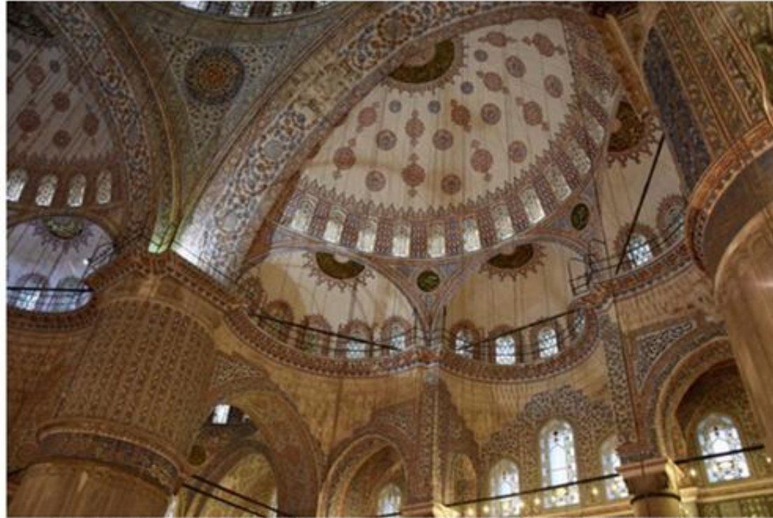
The intricate artwork inside Sultan Ahmed Mosque Dome

New research identifies a strong fixation on the Western canon in Wikipedia's coverage of visual arts, but offers ways towards a more truly global perspective.