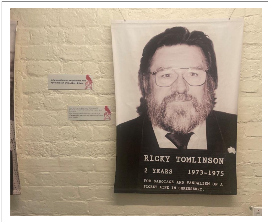
Figure 1. Celebrity prisoners: exhibit display featuring a large poster about Ricky Tomlinson, highlighting his two-year sentence from 1973 to 1975 for alleged sabotage and vandalism during a picket line in Shrewsbury.

perhaps - as 'collectively similar and familiar' all the same (Barton and Brown, 2015: 247–248). What a focus of this kind also enables though is arguably an erasure of the differences between the site's former prisoners, all of whom are grouped into categories aligned with extreme criminality, devoid of any explanation or reference to underlying factors that might have led to that criminal/offending behaviour in the first place (an example of which might be poverty). As Thurston's (2021: 330) study also highlights, what we are seeing here are examples of the pains of imprisonment being undermined, violence getting sensationalised, and individuals getting blamed as opposed to structures.