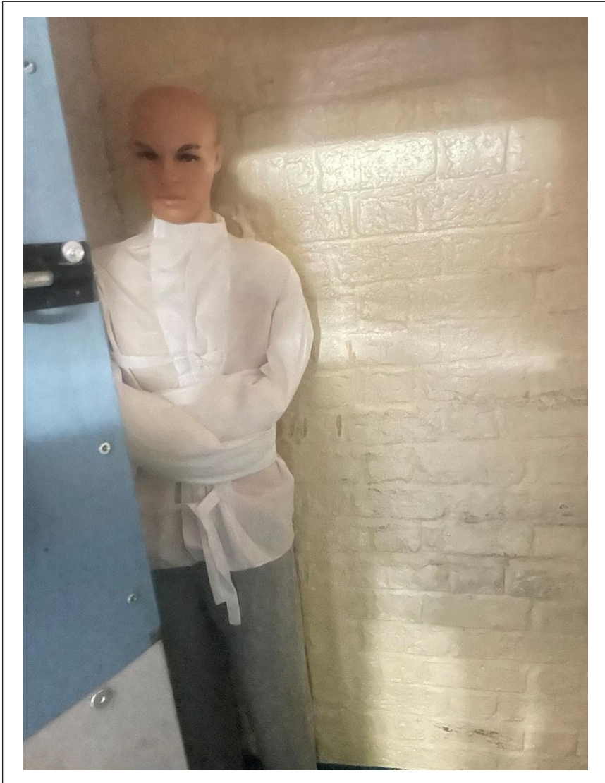
Figure 2. A prisoner doll in a straitjacket: a mannequin dressed in a straitjacket stands in a narrow, dimly lit brick-walled cell, partially visible through an open metal door.

Elsewhere on that floor, there is interesting reference to ‘Samaritan-trained prisoners’ as volunteer ‘Listeners’ for those prisoners who struggled ‘to speak to’ in the ‘Intervention Suite’, all of which positively connote the room in question (see Figure 3).