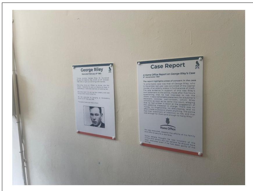
Figure 4. Execution room posters: two wall-mounted information boards summarise the case of George Riley, including a home office case report and background details about the conviction.