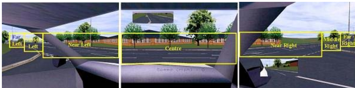
Figure 1: Categorisation of visual scene into 'areas of interest' defined by distance from driver position.

A SensorMotoric Instruments (SMI) head mounted eye tracking system was used to collect data relating to gaze and these data were stored in MPEG format. Analysis was conducted using Observer 3.0. The simulation environment comprised a fixed based driver assessment rig and a simulated junction scenario. The visual scene was divided into seven areas of interest (AOI) as shown in Figure 1. 'Far' AOIs represent distances of more than 60m from the driving position, 'middle' AOIs 20-60m, 'near' AOIs less than 20m and the 'centre' AOI within 10m. The scenario started with a convoy of eight cars passing the junction from both directions followed by a series of negotiable gaps that increased in 1.5s increments. A predefined finished point was identified in the straight section of the road following the right turn manoeuvre.