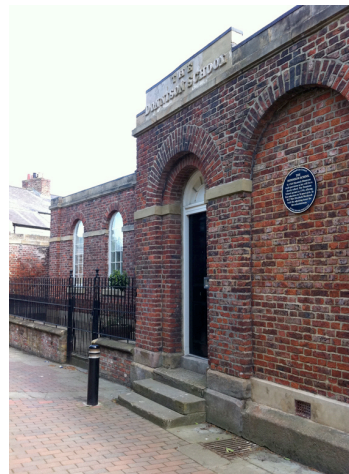
Figure 1. The Donnison School

The study was undertaken in the context of a Victorian classroom at the Donnison School Museum. The Donnison School is a well preserved 18 th Century school originally established to provide educational opportunities for the 'poor girls' of Sunderland (UK), Figure 1.