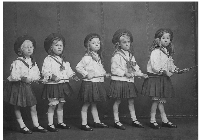
Figure 3a and 3b. Natural and Staged Photo Pair