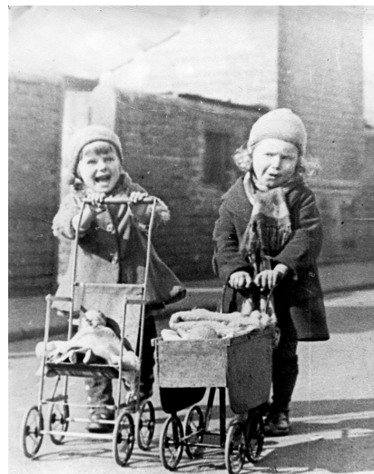
Figure 2. Archive Photograph

The school is situated within the Sunderland Heritage Quarter, a regeneration project in the East End of the City of Sunderland and provides children across the city with an authentic experience of school in Victorian times. Thirty children aged 9-10yrs at Key Stage 2 took part in the study. All thirty children came from one local school, also situated within the regeneration area, and a short walking distance from the museum. The Donnison School also operates as the Regional Oral History Centre for Living History North East (LHNE) and has a large archive of over 25,000 historic photographs documenting the social and economic history of Sunderland and the North East region Figure 2.