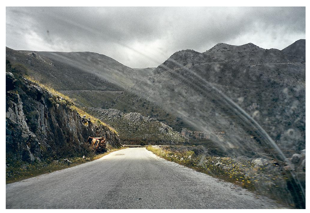
Fig. 20. Peloponnese, Greece, 2000 (from the series Notes at the Edge of the Road, 2000-6)

Notes starts where Kath' Odon ends: on the road. In the latter, the crack on the windscreen shows the way amid a sandstorm; being the last image in the book it is also an allusion to the journey continuing. In the former, the windscreen's filthy curve directs the view into the open: the journey is beginning (see fig. 20).