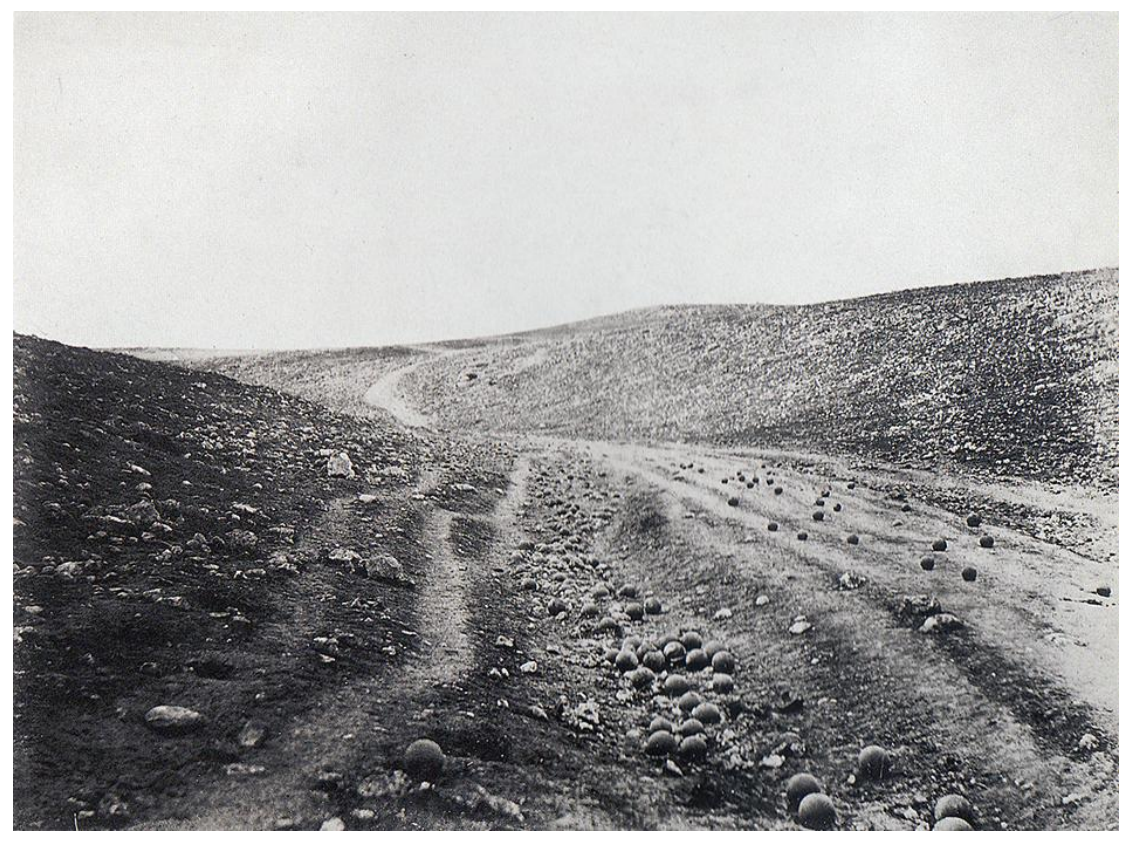
Fig. 27. Roger Fenton, The Valley of the Shadow of Death, 1856