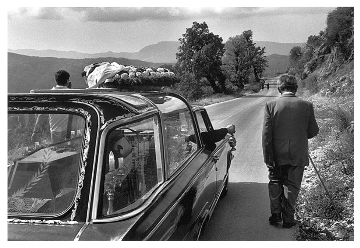
Fig. 9. Funeral, Epirus, Greece, 1993 (from the series Kath' Odon, 1993-7)