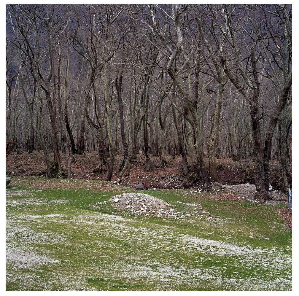
Fig. 31. Thessaly, Greece, 2003 (from the series Notes at the Edge of the Road, 2000-6)

A creek flows across the centre of the picture plain, separating a thick wood of naked trees from a bare dumping ground. Grass has also begun to grow around it; not much but enough to make a difference. Indeed, more than composition, vantage point or colour, it was this discreet gesture of nature that made the photograph complete in my eyes. No matter how framed, composed or coloured it is, the place in figures 29 and 30 seems to suffer the indignity of being nothing but a sterile dumping ground—nowadays a fashionable photographic repertoire. In contrast, in figure 31, the grass relates the two planes (the ground and the grove) chromatically, compositionally and conceptually. Acculturated and unadulterated nature are no longer segregated in a representation both evident and rigid. Assisted by the enhanced presence of the trees in the composition, the recuperating 'function' of the grass rebalances the frame, adds time, releases ambiguity.