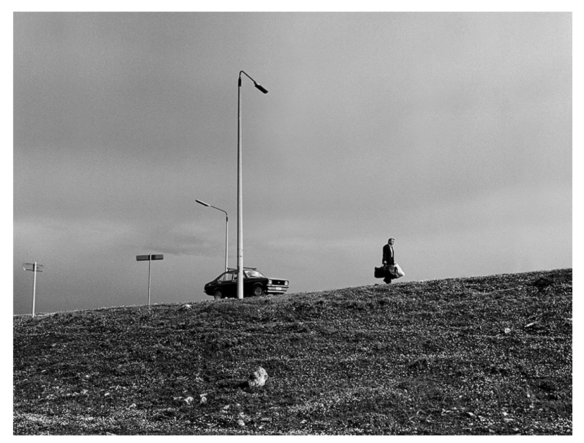
Fig. 15 Thessaly, Greece, 1999