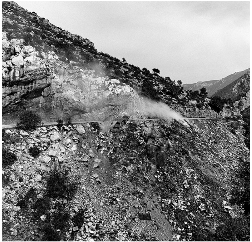
Fig. 18. Arcadia, Peloponnese, Greece, 1999