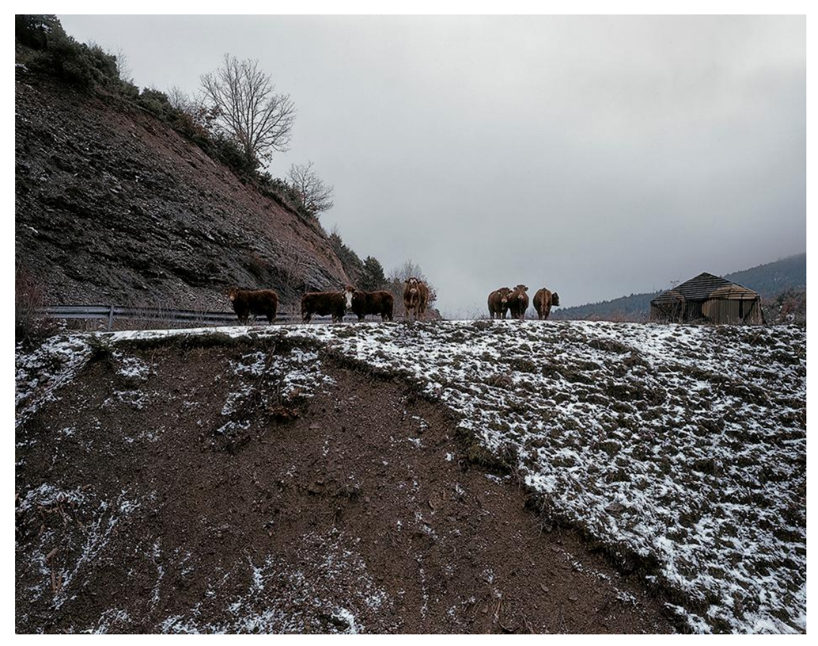
Fig. 25. Macedonia, Greece, 2005 (from the series Notes at the Edge of the Road, 2000-6)