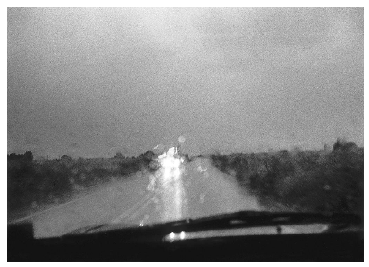
Fig. 13. Macedonia, Greece, 1997 (from the series Kath' Odon, 1993-7)