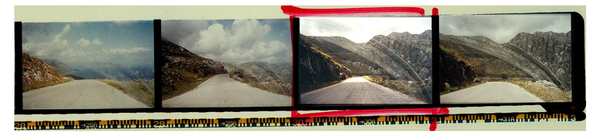
Fig. 21. Contact sheet (detail), Peloponnese, 2000

This kind of operational practice is absent in the Greek paradigm. And so are animals as subject matter.