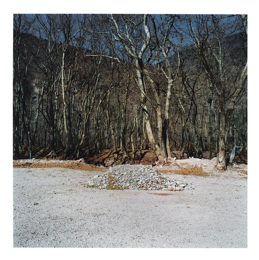
Fig. 30. Thessaly, Greece, 2003

Exposed within a year of one another from a different angle and under different light and colour conditions (see figs. 29 and 30), a clearing and a grove seem to have found their definite coexistence as we see in figure 31.