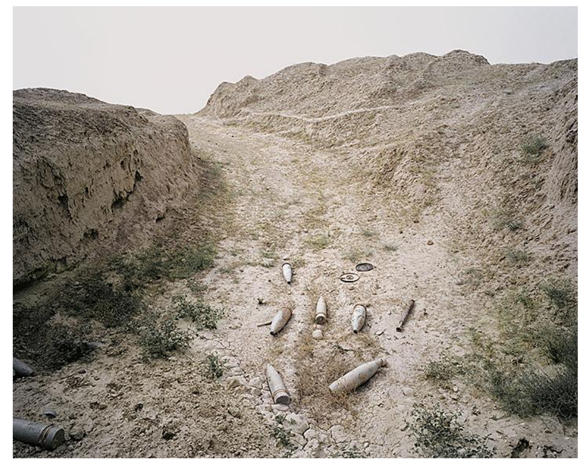
Fig. 28. Paul Seawright, Valley, 2003