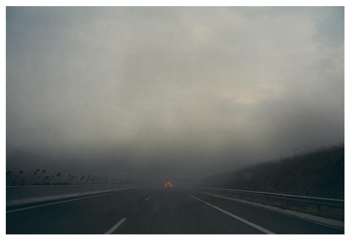
Fig.32 Thessaly, Greece, 2001 (from the series Notes at the Edge of the Road, 2000-6)

The series' title, Notes at the Edge of the Road , is suggestive of this contingency. Notes are usually associated with text: quickly noted observations for future use. In the context of this work the use of the word notes aims to imply that despite the finality of the images (it is a finished piece of work, after all) even within the 'eternal' landscape, everything is in flux—ephemeral, unpredictable and everchanging. Exactly like a journey; an actual as well as an internal one.