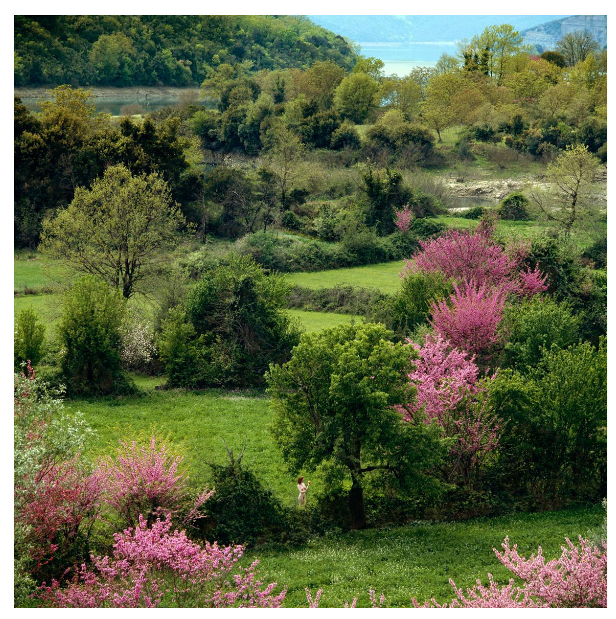
Fig. 7. P. Kokkinias, Megla, 2004 (From the series Landscapes, 1997-)