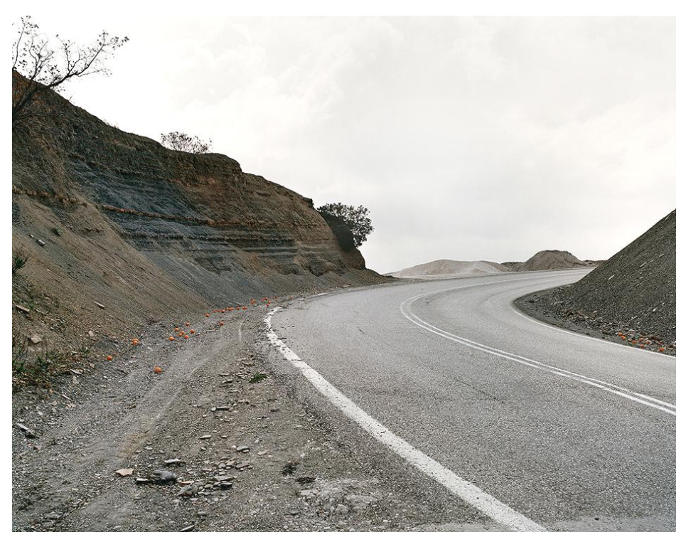
Fig. 26. Epirus, Greece, 2004 (from the series Notes at the Edge of the Road, 2000-6)

Indeed the scattered oranges on both sides of a paved road as it cuts through a construction site, reminded to me the famous Fenton photograph from the Crimean war as well as Seawright's associative image (the titles are telling) from the Afghanistan war (see figs 26, 27 and 28 respectively).