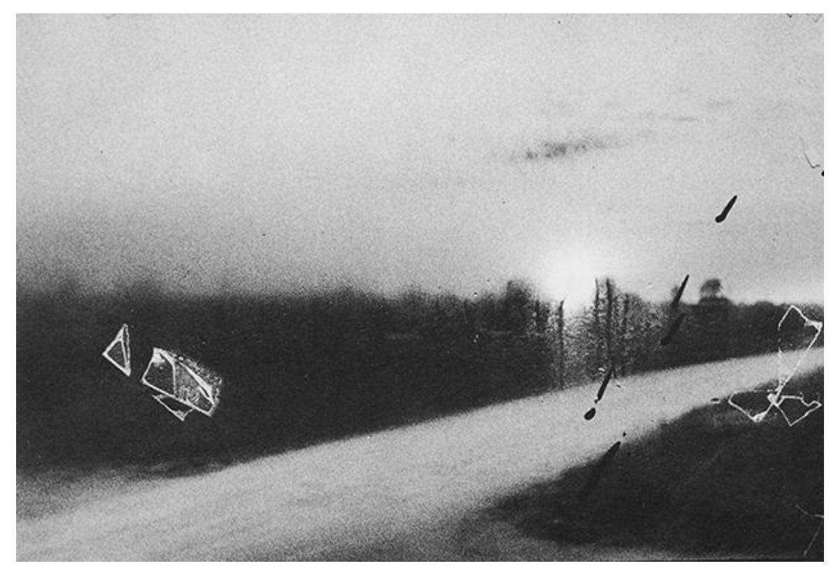
Fig. 12. Macedonia, Greece, 1991

Taken through the window of a moving train, a sun is rising (or setting) above a country road that traverses the lower half of the picture plane diagonally. The window itself makes its presence visible as pieces of scotch tape and dirt in the shape of exclamation marks are stuck on it, creating a separate plane superimposed on the dampish landscape. Both, the white tape and black dirt are quite distinct as they 'sit' against the blackness of the earth and the grayness of the road/sky.