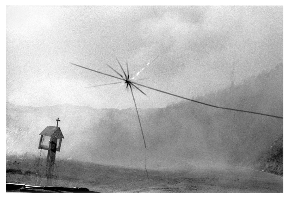
Fig. 14. Macedonia, Greece 1993 (from the series Kath' Odon, 1993-7)