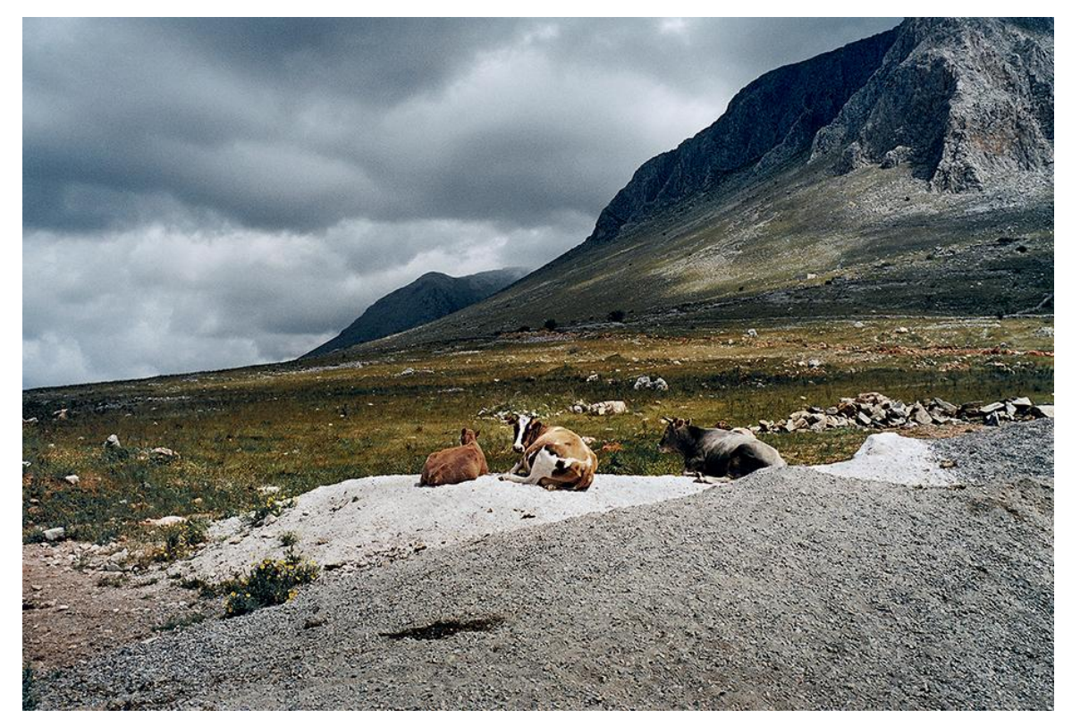
Fig. 24. Peloponnese, Greece, 2000 (from the series Notes at the Edge of the Road, 2000-6)

Take for example figs. 24 and 25 (see next page) for example. Notwithstanding their technical or iconographic differences (i.e. distance, format, light, colour, atmospheric conditions), both images seem to suspend the same riddle: who is blocking whose way? Who is in exile?