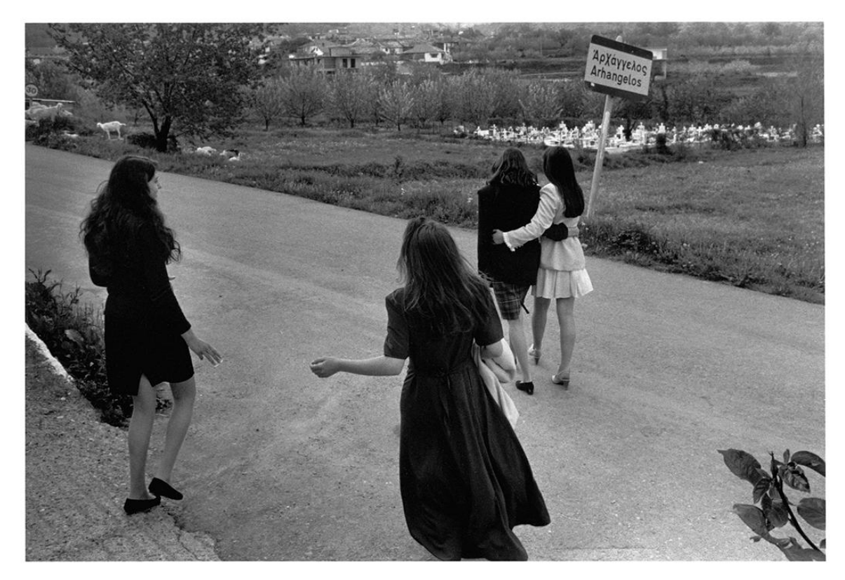
Fig. 10. Archangel, Macedonia, Greece 1994 (from the series Kath' Odon, 1993-7)