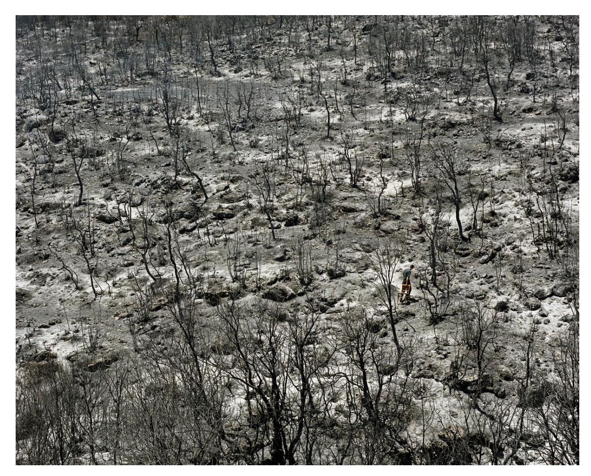
Fig. 6. P. Kokkinias, Syrna, 2001 (From the series Landscapes, 1997-)

Sharing the aforementioned photographers' high definition of and physical distance from their subject-matter, Panos Kokkinias' landscapes (see figs. 6, 7) are meticulously yet discretely constructed allegories set in the countryside. Kokkinias usies the landscape as a mise en scène whose contents (lighting, props, camera position, actors) compose a set of unresolved riddles that touch upon the modernist premises of the medium (verisimilitute, decisive moment, truthfulness, etc.). 'Real' or otherworldly, contigent or staged "the artifice behind their making is cleverly concealed as they do appear authentic, so much as to verify their inauthenticity."<sup>15</sup> Like the titles of his pictures —named after the nearby insignificant village or location— Kokkinias seems to suggest that the fabrication of the picture does not matter as much as its reading. As for the latter, it is carefully left open.