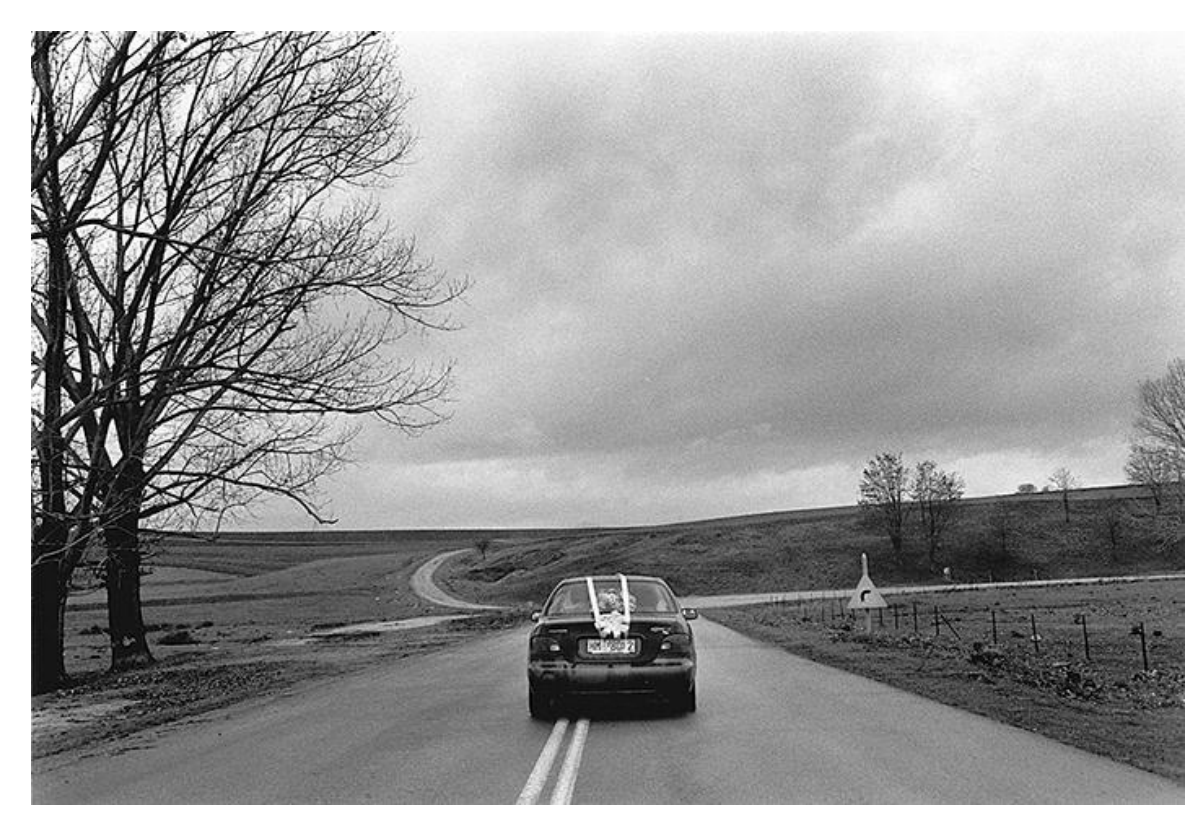
Fig. 8. Wedding, Macedonia, Greece, 1997 (from the series Kath' Odon, 1993-7)

Already present in my first monograph Kath' Odon <sup>29</sup> (1998), the road as landscape became my sole preoccupation in Notes (2006). Kath' Odon is a documentation of the exigencies of the agricultural multi-tribal societies living along Greece's northern borders and the road leads to places and people. Whenever it appears in the landscape it is usually perceived as a supplement, a background to an action performed by the natives, whether this be a wedding, a funeral, a Sunday stroll or something else (see figs. 8, 9 and 10).