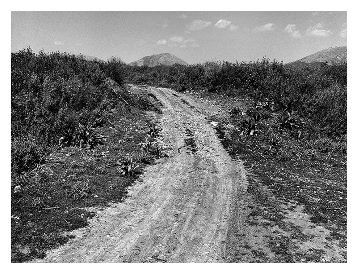
Fig.16. Sterea Hellas, Greece, 1999