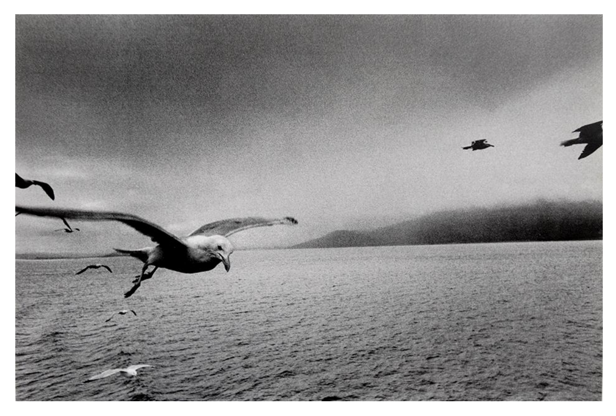
Fig. 23. Josef Koudelka, Scotland, 1977