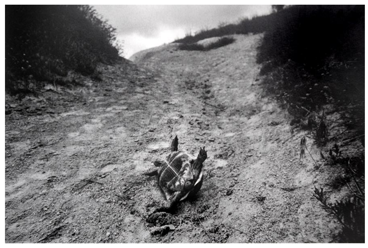
Fig. 22. Josef Koudelka, Turkey, 1984