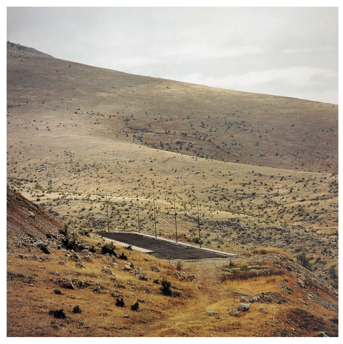
Fig. 2. G. Yerolymbos, Asphalt works, Xanthi, Thrace (from Terza Natura, 2000-3)