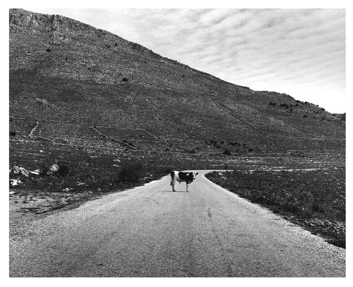
Fig. 19. Mani, Peloponnese, Greece, 1999