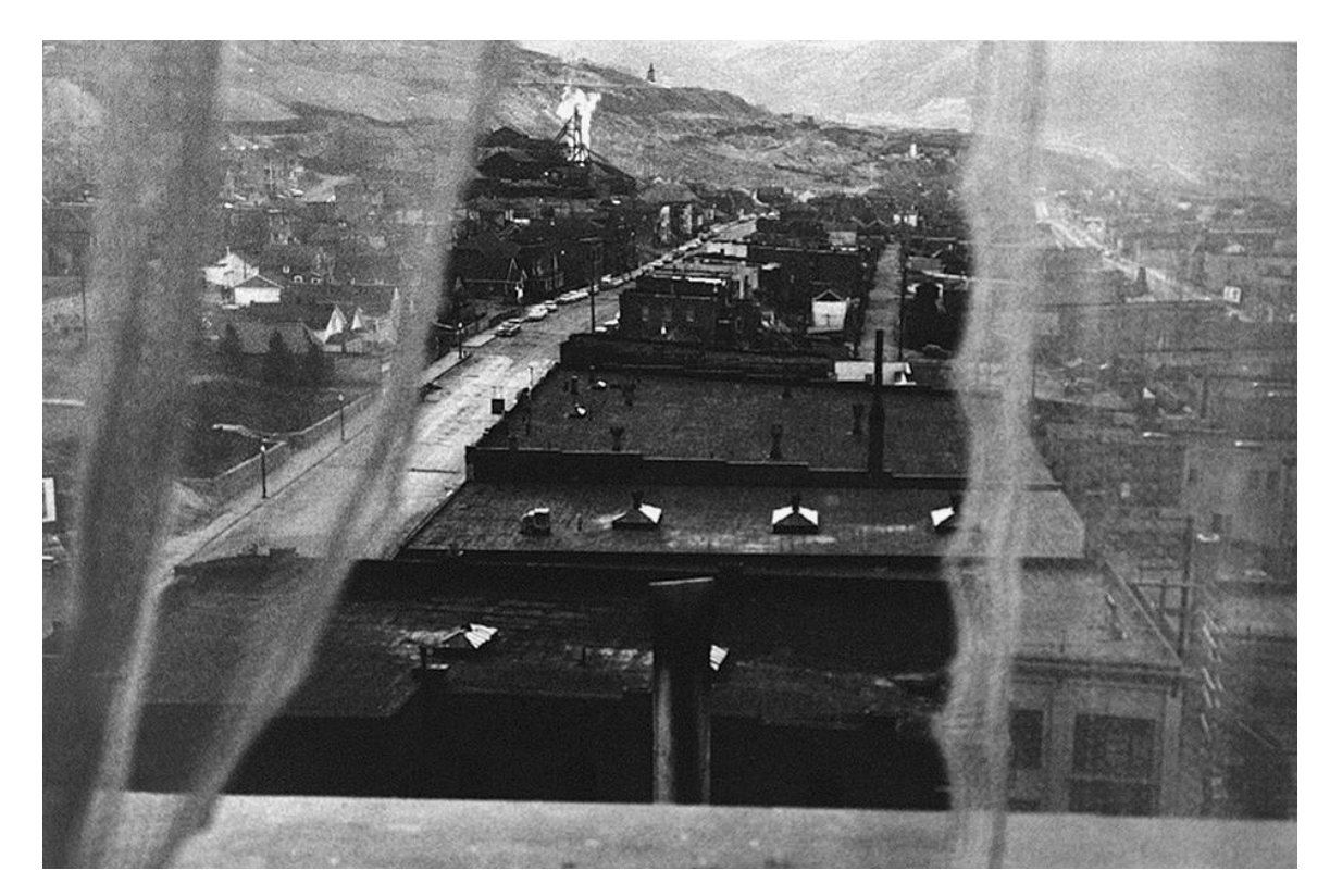
Fig. 11. Robert Frank, View from hotel window, Butte, Montana, 1955-6

Yet, not quite. Kath' Odon is not only the documentation of a provincial society but a personal journey as well.<sup>30</sup> Like Notes , the book begins and ends literally on the road (see figs 13 and 14). The landscapes depicted alongside it are also inner landscapes. In the manner of Frank, (see fig. 11), the picture plain is subjectivized by introducing traces of my concurrent situation into it.<sup>31</sup> 'Seeing through' becomes an instinctive and spontaneous device that transforms 'objective' reality (the landscape, the road) into an imprint of subjective experience.