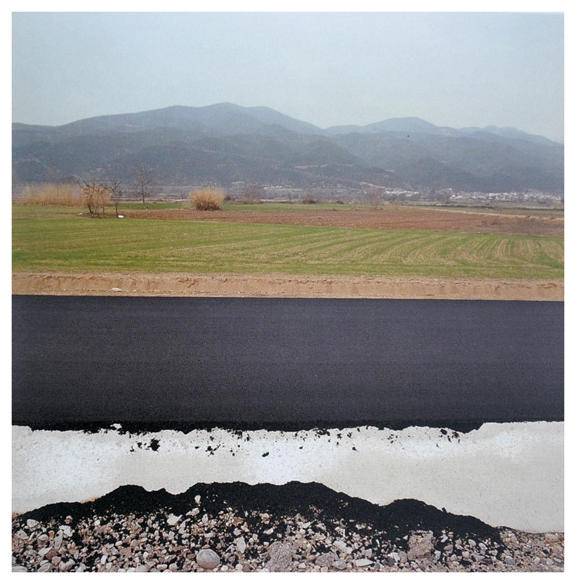
Fig. 1. Y. Yerolymbos, Siatista, Western Macedonia (from Terza Natura, 2000-3).