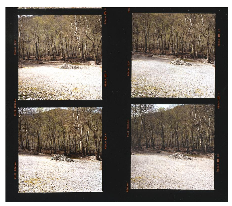
Fig. 29. Detail from contact sheet, no. 39, 2002

Exposed within a year of one another from a different angle and under different light and colour conditions (see figs. 29 and 30), a clearing and a grove seem to have found their definite coexistence as we see in figure 31.